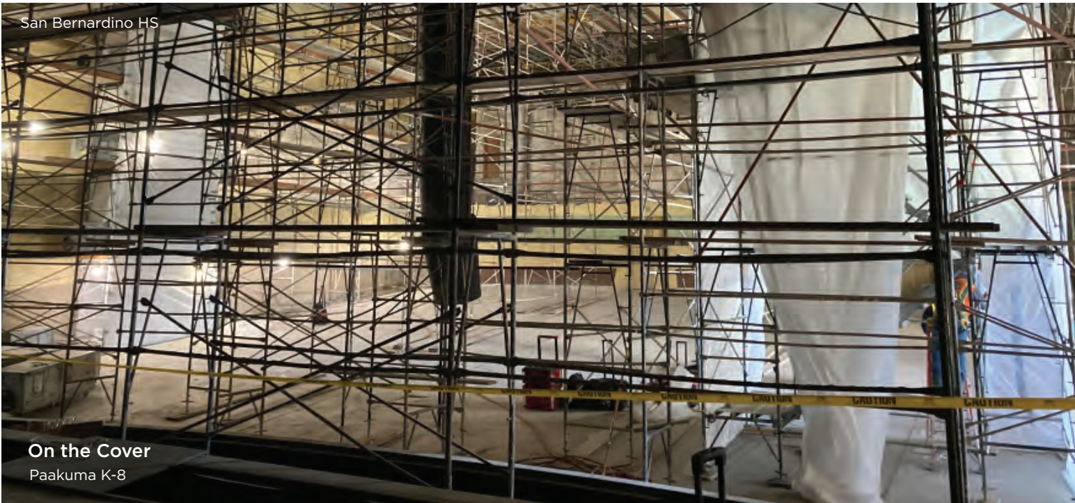
On the Cover Paakuma K-8