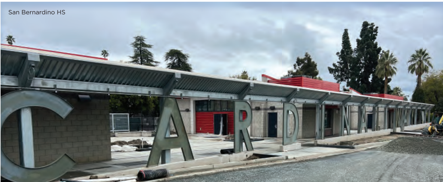
San Bernardino HS