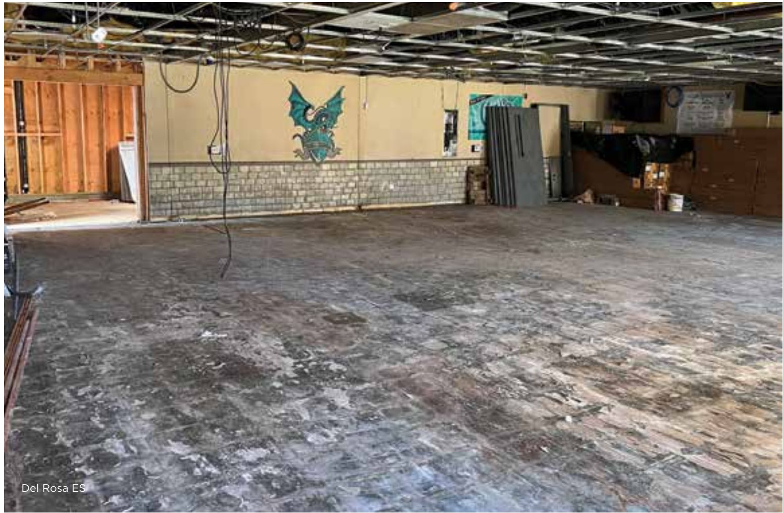
Del Rosa ES