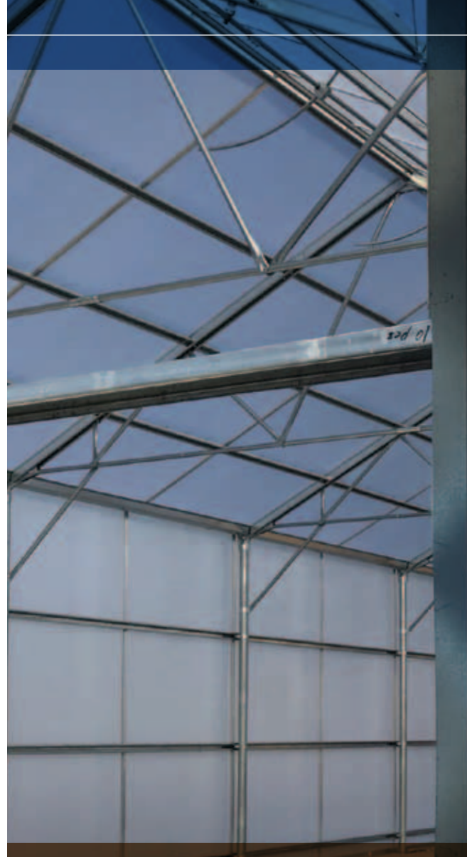
Citizens' Oversight Committee

Measure T and N Bonds March 2019-February 2020