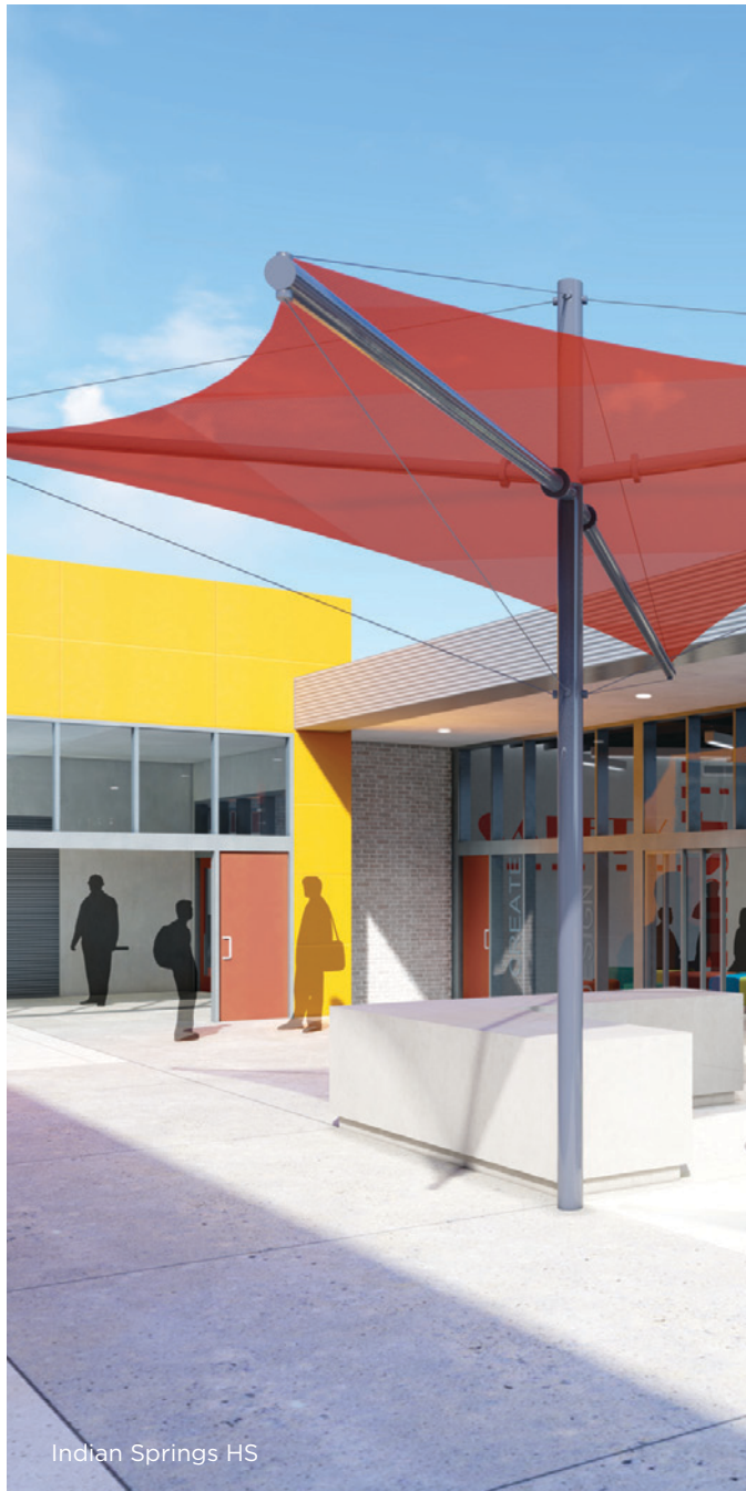
Indian Springs HS