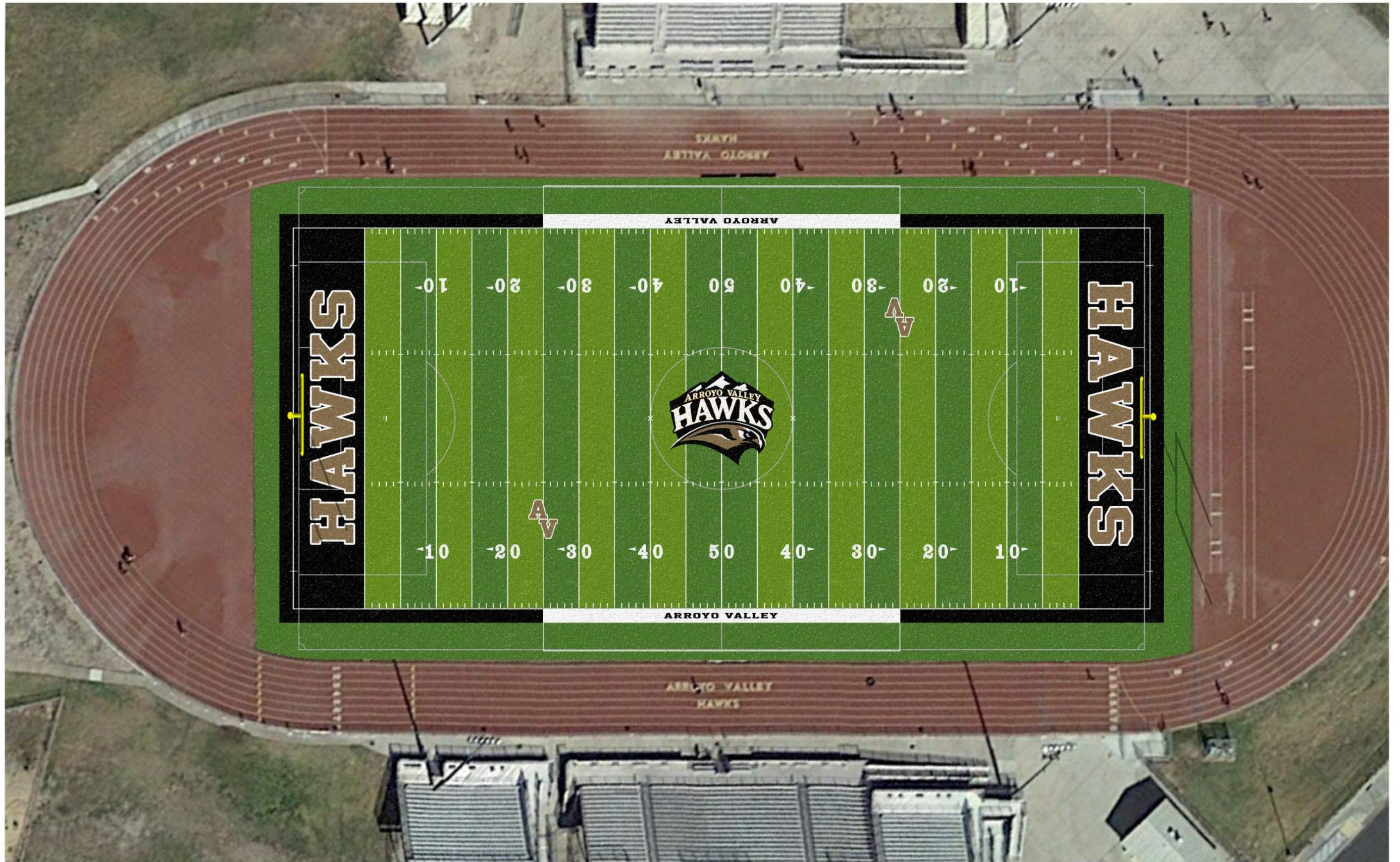
FIELD RENDERING SCALE: 1" = 40'-0"