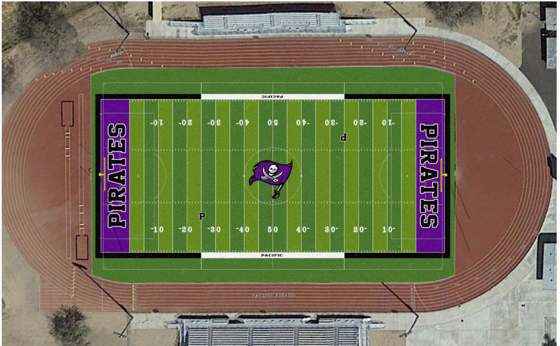
FIELD RENDERING SCALE: 1" = 40'-0"