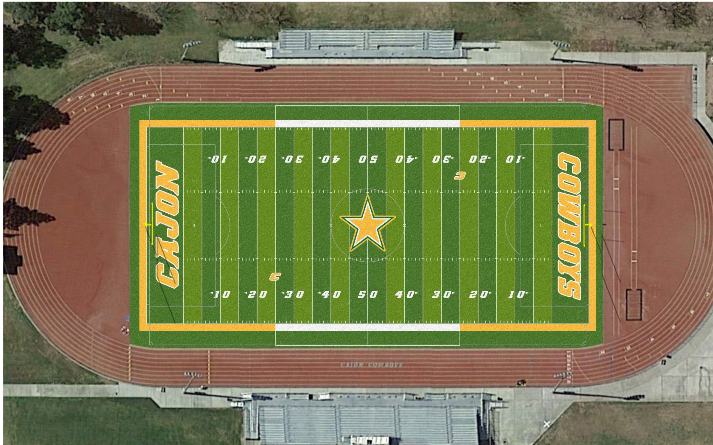
FIELD RENDERING SCALE: 1" = 40'-0"