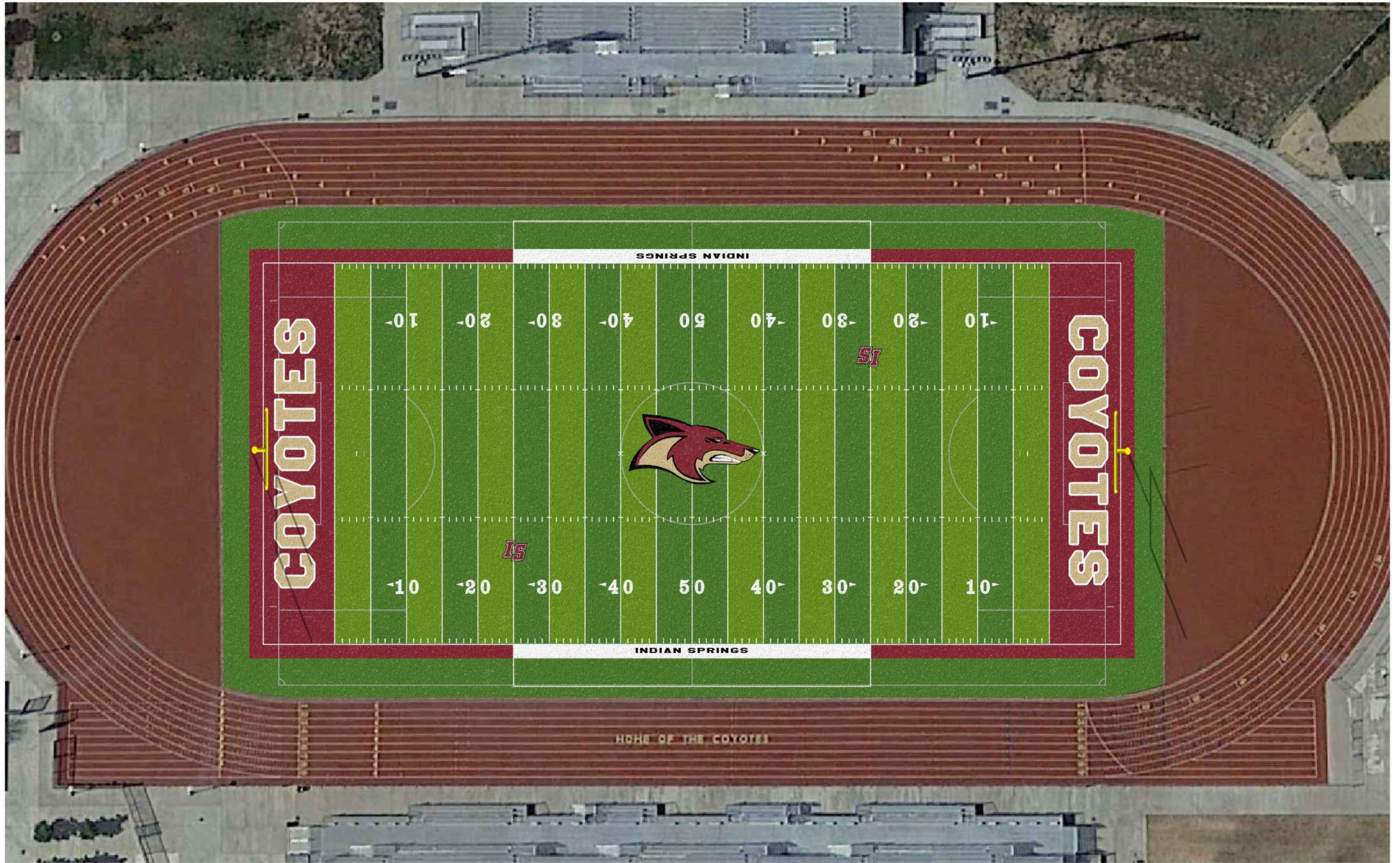
FIELD RENDERING SCALE: 1" = 40'-0"