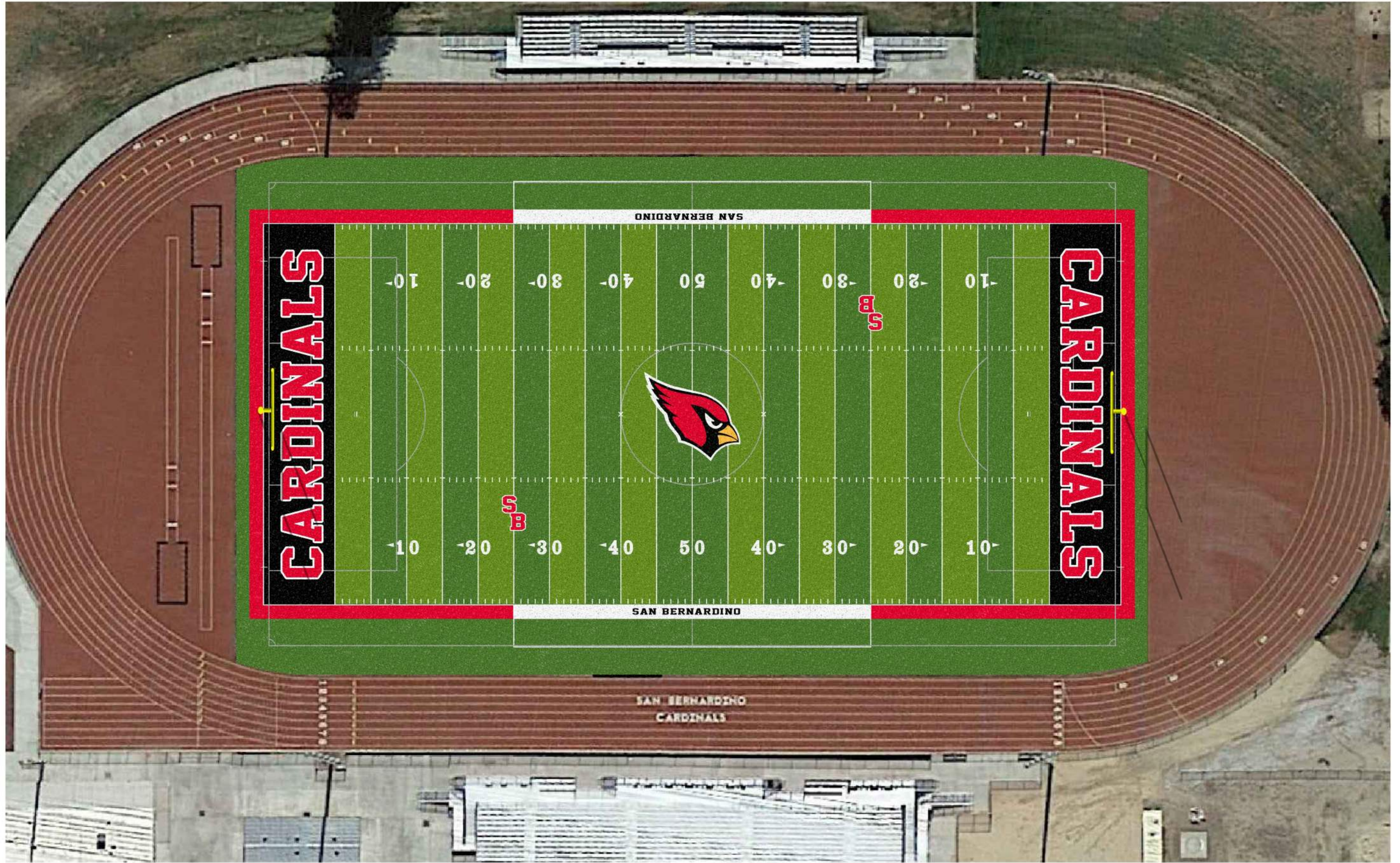
FIELD RENDERING SCALE: 1" = 40'-0"