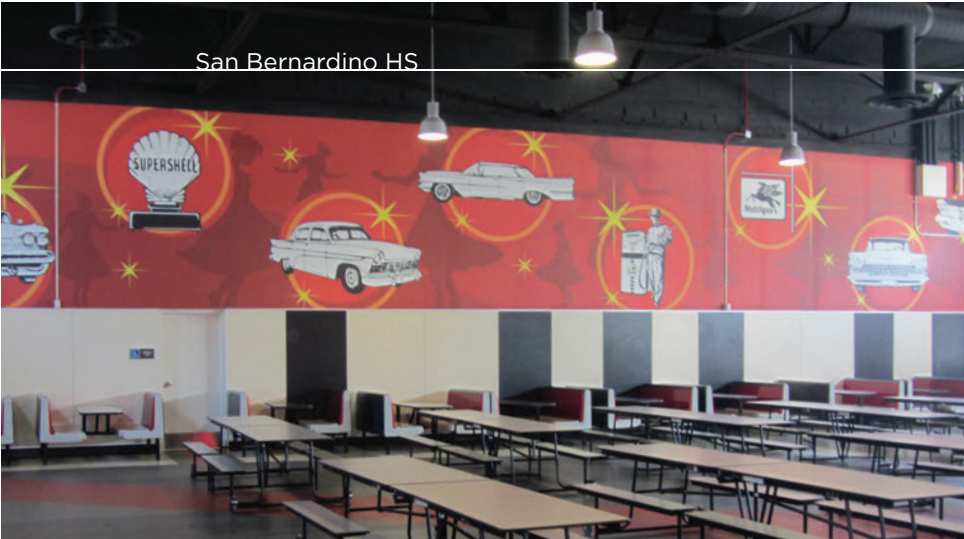
San Bernardino HS

Use of Facilities request forms may be obtained at any school or at the SBCUSD Facilities desk at 956 West 9th Street, San Bernardino. For more information on how to reserve a facility, contact the Facilities Use Clerk at (909)388-6100.