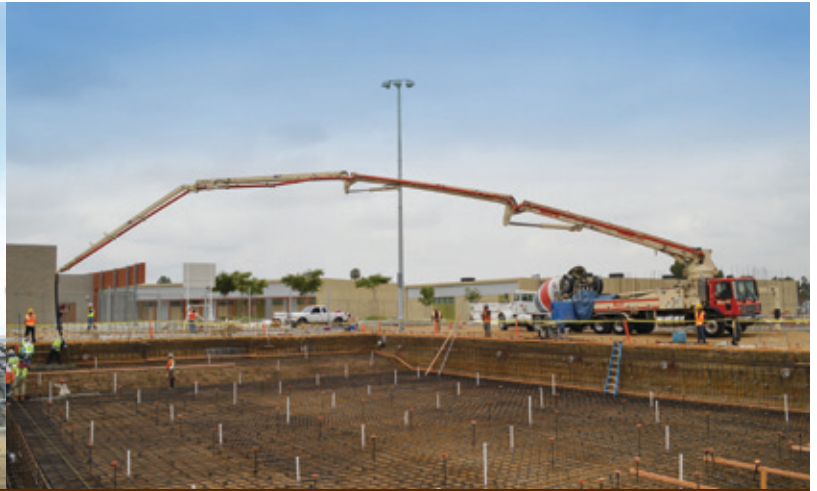
Indian Springs HS - Pool Installation