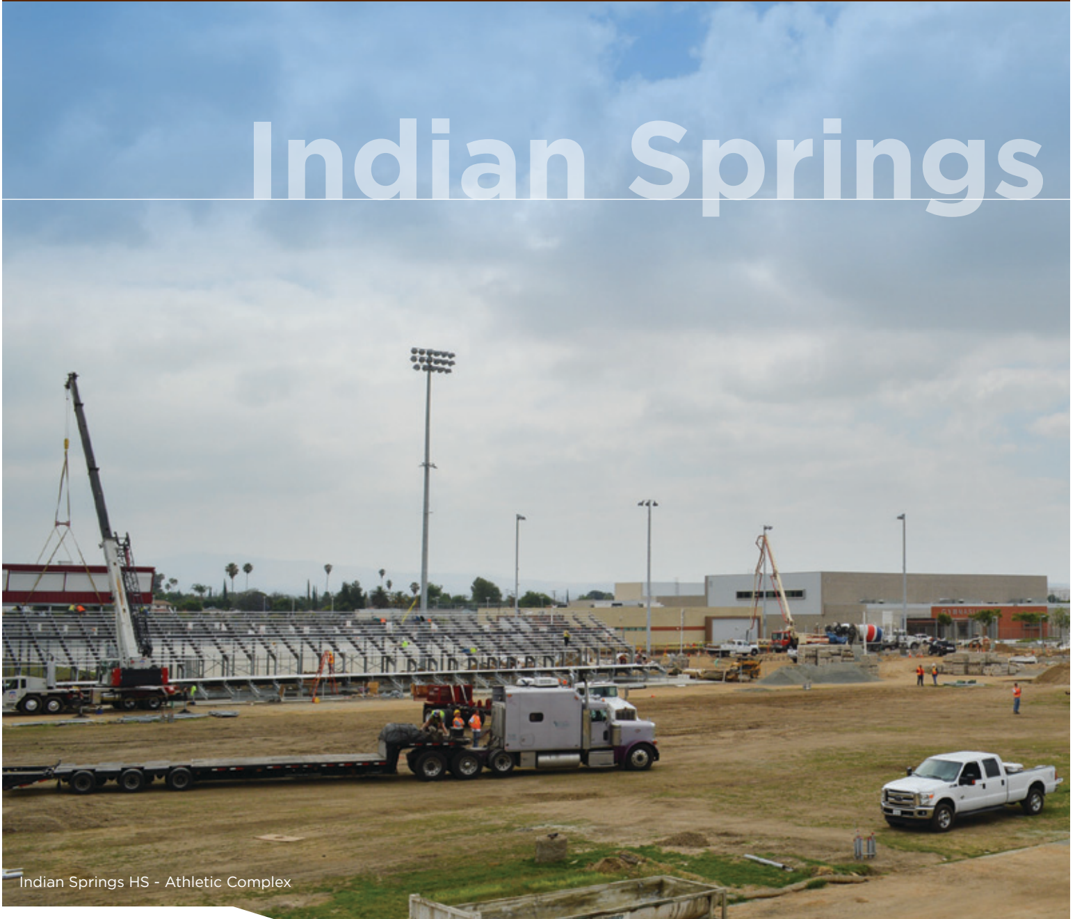
Indian Springs HS - Athletic Complex