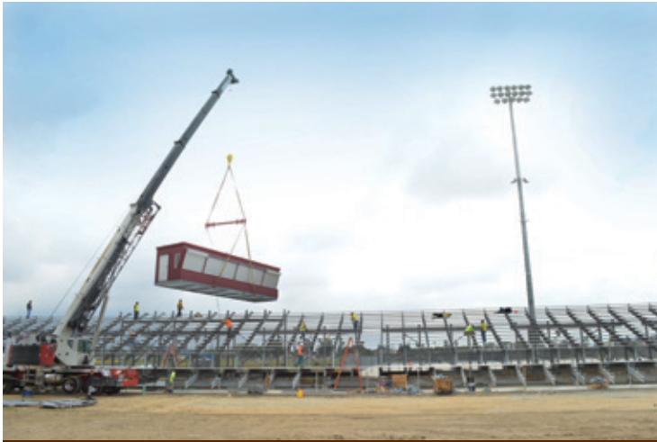
Indian Springs HS - Stadium Press Box Installation