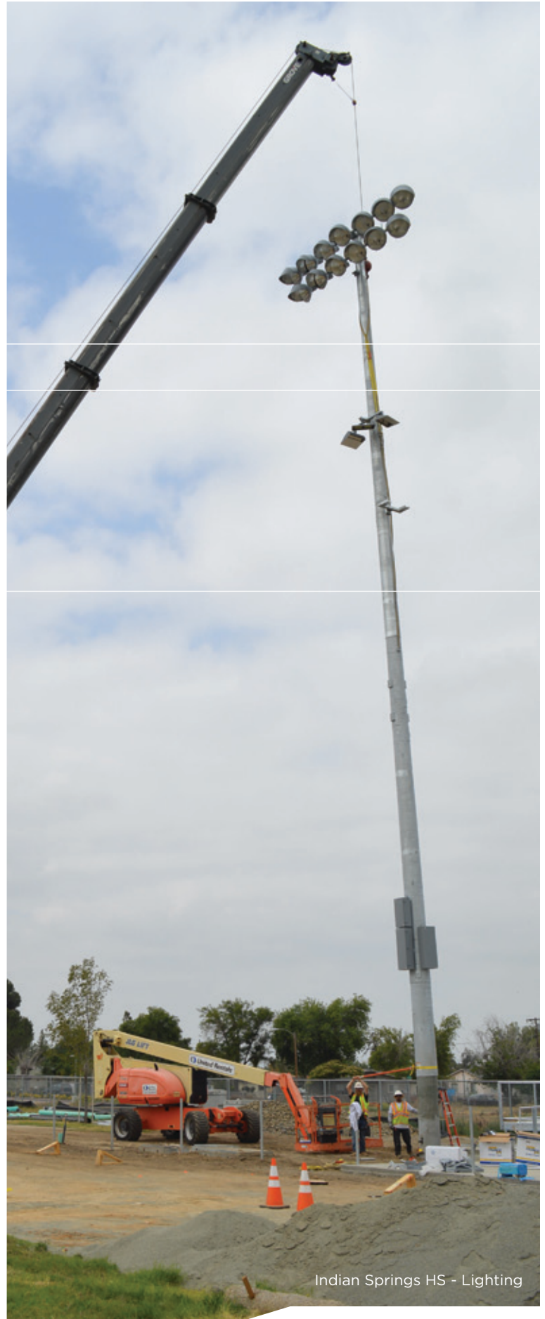
Indian Springs HS - Lighting