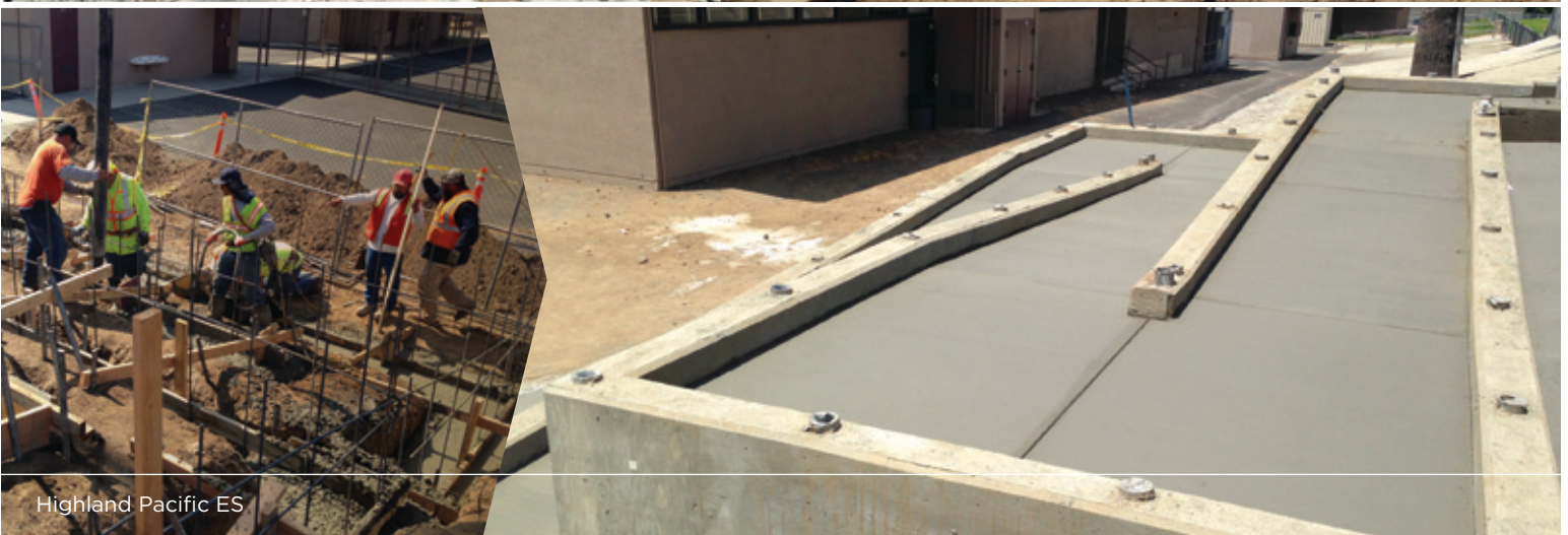
Highland Pacific ES