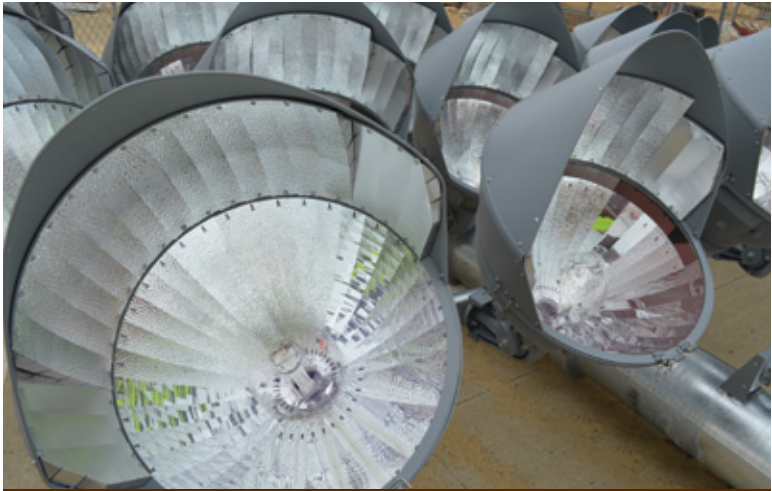
Indian Springs HS - Lighting