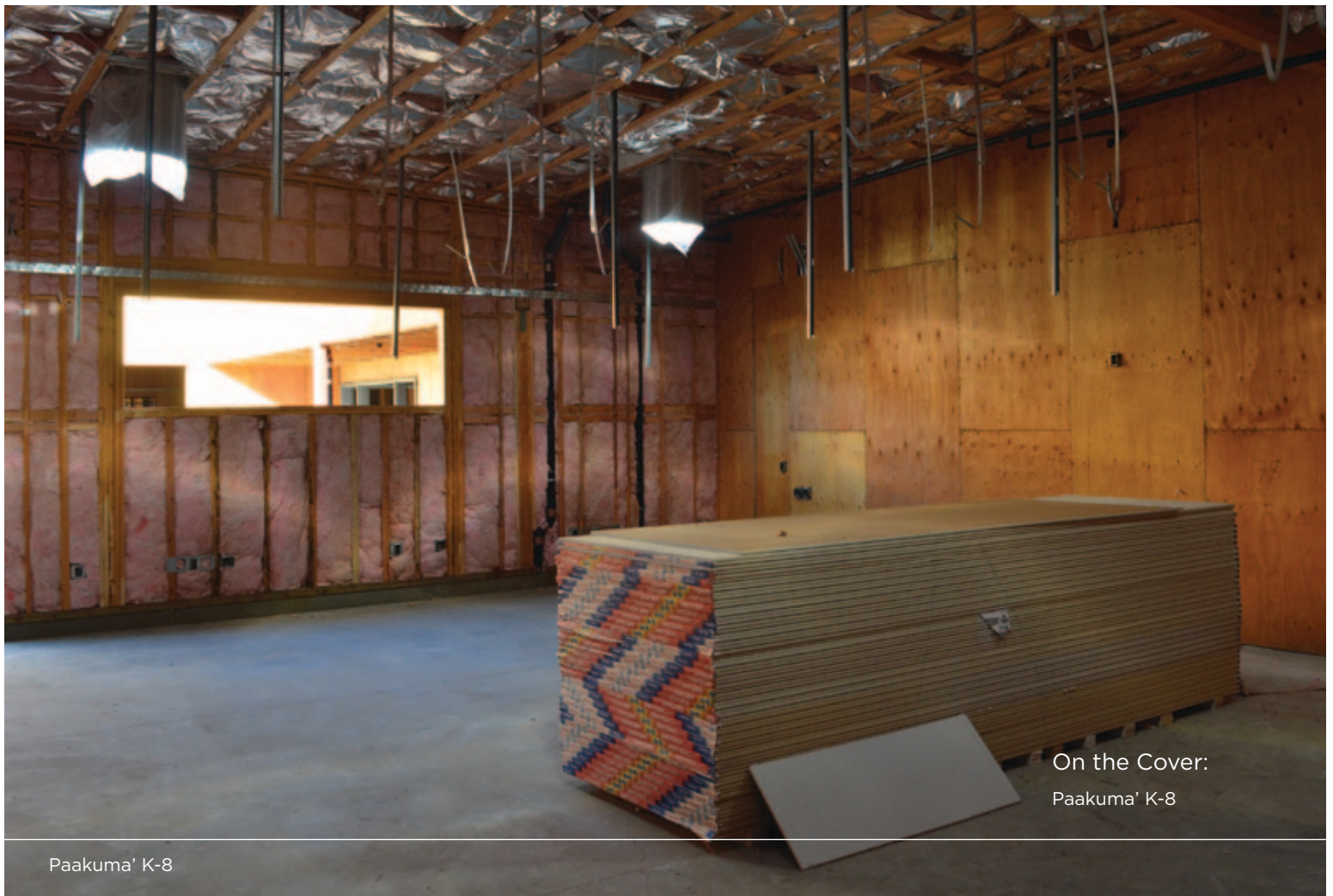
On the Cover: Paakuma' K-8