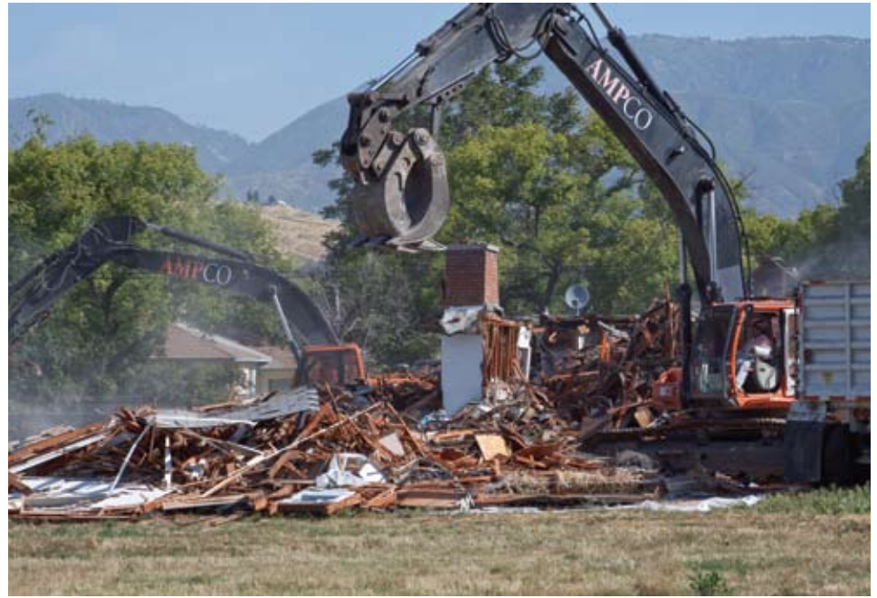
Demolition at the Brown Elementary School site in May. Three new campus sites have undergone abatement and demolition work during the past three months.

removed from the sites. The next step is soil remediation, a process that removes contaminants from the soil.