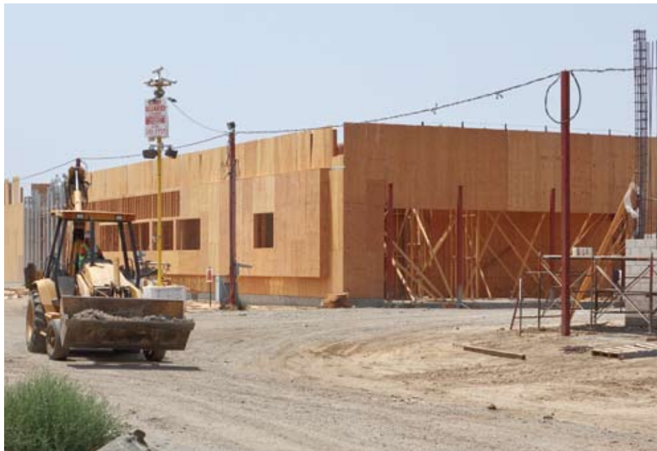
Cover One of the support beams constructed for masonry work at Indian Springs HS.

Some work where two elementary schools and a high school will be built have started with pre-construction work. Existing buildings at Brown Elementary School, Norton Elementary School, and Middle College High School sites were inspected for any hazardous materials such as asbestos and lead. Any amounts found were specially handled and removed from the sites. Afterwards, demolition work on the structures began. By the end of July, all of the structures at each site had been leveled and debris