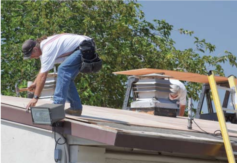
Maintenance & Operations workers installing new roofing materials on top of a building at Hillside ES.

Part of the objective of the Deferred Maintenance Program is to perform major repairs and replacements at campuses throughout the District. A few of the projects were coupled with ongoing modernization projects.