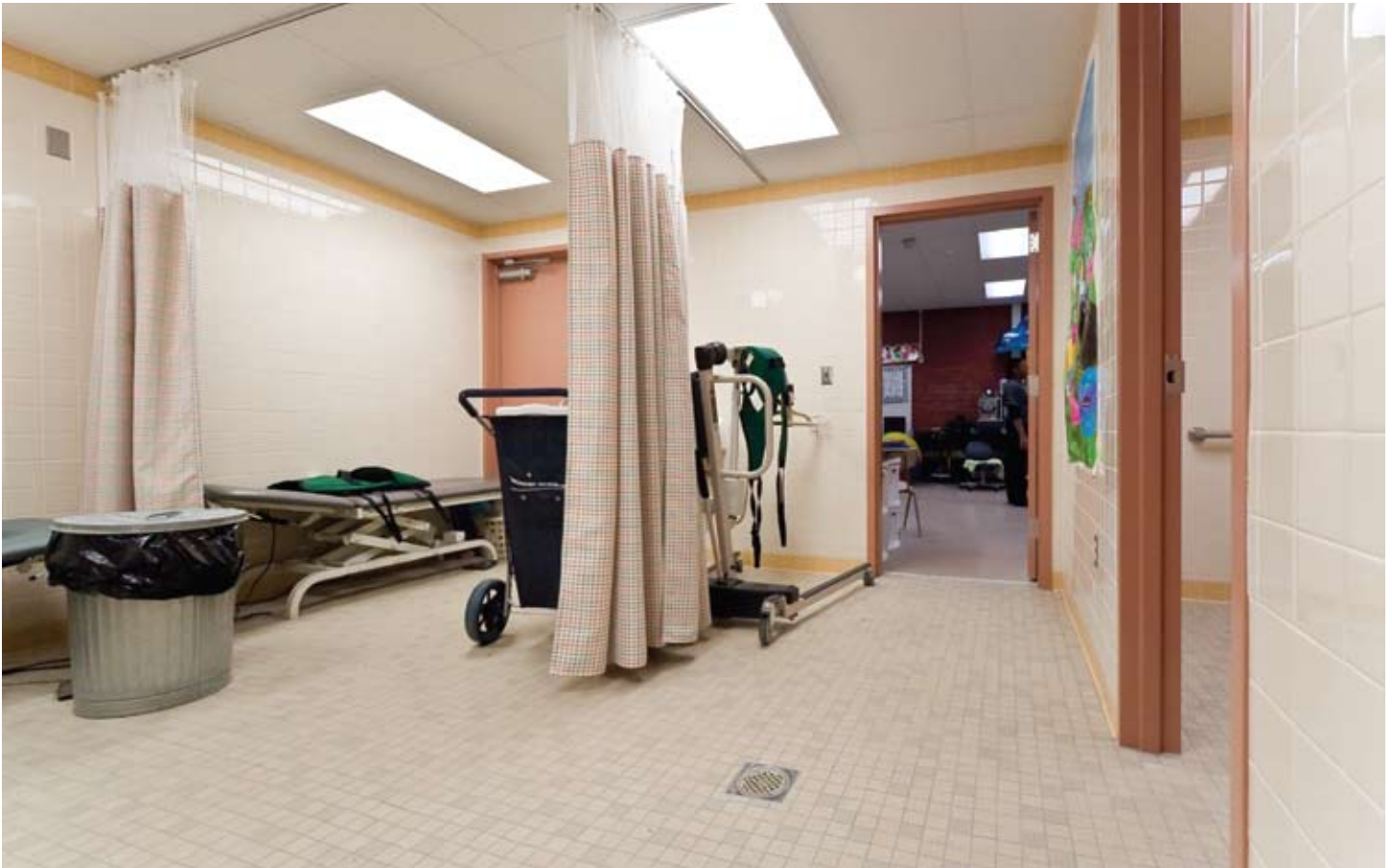
Inside the remodeled restroom/therapy room at Anderson Special Education.

classrooms and accompanying restrooms. Demolition work has started at Wilson Elementary School. New ADA-accessible cabinets have been installed inside classrooms at Monterey Elementary School, along with the completion of upgraded support columns that support the walkways.