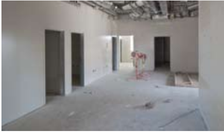
A view inside one of the modernized buildings at Indian Springs High School.