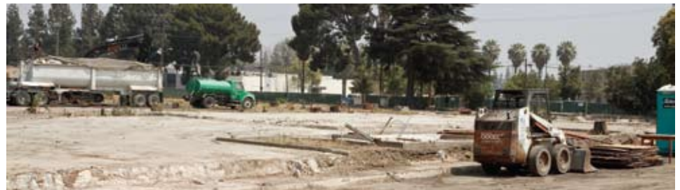
Clearing debris from the Middle College High School site. The next step in the pre-construction phase will be the remediation of the soils at each site.

removed from the sites. The next step is soil remediation, a process that removes contaminants from the soil.