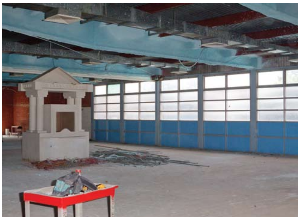
Inside the cafeteria at San Gorgonio High School, where renovations are taking place.

Work continues inside the gymnasium and cafeteria. A more accelerated schedule has been planned for this phase to coincide with opening day of school in August. Inside the gymnasium, new fire retardant and insulation have been applied to the ceilings, with new ceiling systems next to be installed. Inside the locker rooms, new ramps have been constructed to allow easier access for those with disabilities. Restrooms and showers have been re-framed and re-tiled. Inside the cafeteria, abatement work has been completed and the process of remodeling is about to begin. Once the two buildings are