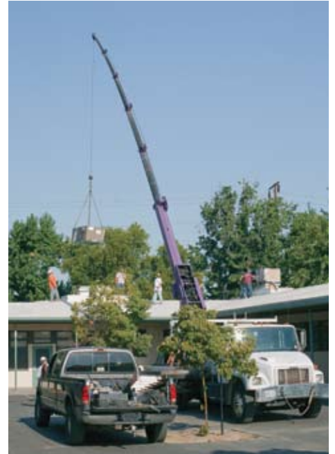
New HVAC units being placed on top of the roofs at Warm Springs ES.