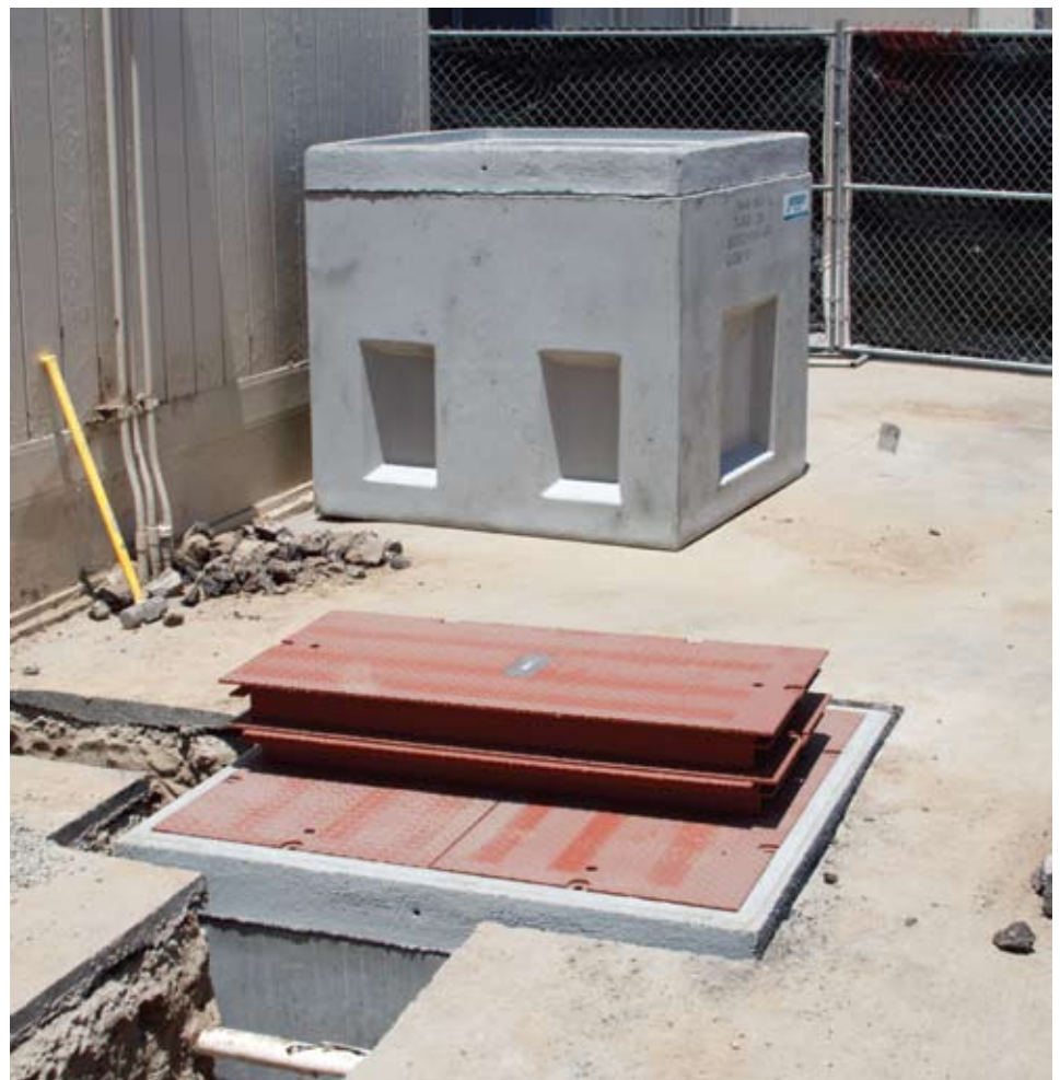
New electrical lines have been placed at Hunt ES to support a relocated teacher’s lounge and library.

This group of projects have reached the halfway point. Extensive remodeling work has started at Anderson Special Education inside six