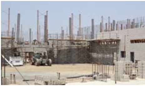
Masonry work for the exterior walls continue for some of the newly constructed buildings.