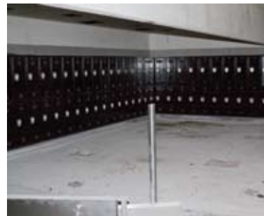
One of the new features will be a new girls' team locker room.