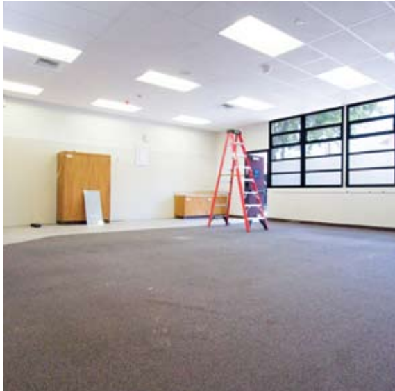
The interior of this classroom at Hillside ES is almost completed.