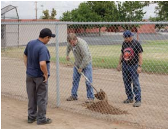
Grounds workers digging the last of the holes to expand the current irrigation system for new grass.