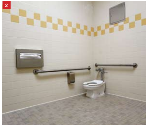
1 Work is almost completed inside this restroom at Anderson Special Education, along with two adjoining classrooms. 2 One of several newly refurbished restrooms at Del Rosa ES. 3 A new ramp and handrails were built in front of this classroom at Monterey ES.