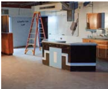
The inside of this home economics classroom is currently being abated.