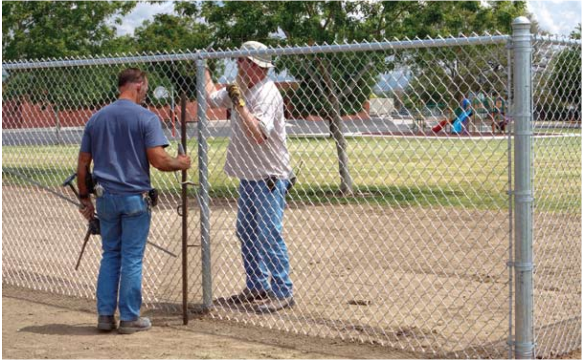
Maintenance Crew workers double-checking the new fence to ensure proper installation and that no sharp edges are found along the edges of the chain link.