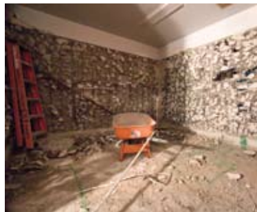
Abatement is also underway inside the restrooms.