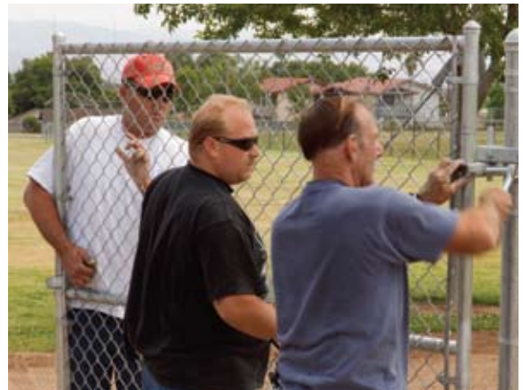
Installation of a new gate. The old fence previously had sharp edges along the top edge which could be dangerous to the children.