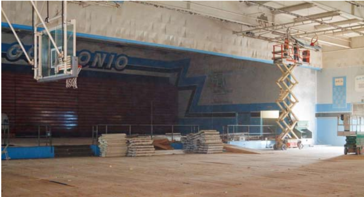
Protective boards line the top of the gymnasium floor. Currently, abatement work has started, including the removal of the current lighting system, as seen here.