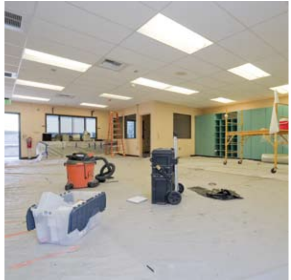
Inside one of the portable classrooms that is currently undergoing renovations at Hunt ES.