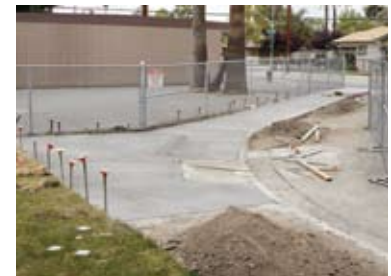
▲ New paths of travel are under construction around Building C at Lincoln ES.