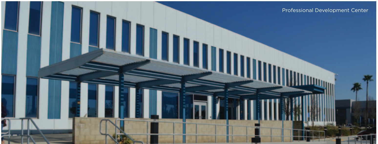
Professional Development Center

On November 6, 2012, voters passed Bond Measure N - the San Bernardino City Unified School District Student Safety and School Repair Measure. Measure N provides bonds in the amount of $250 million and passed overwhelmingly with 71.4% of the vote. To date, Measure N has provided new school police vehicles, printing services technology and equipment, improved lighting for Creative Before-and After Programs for Success (CAPS), construction projects, security and surveillance systems and the purchase of the Professional Development Center.