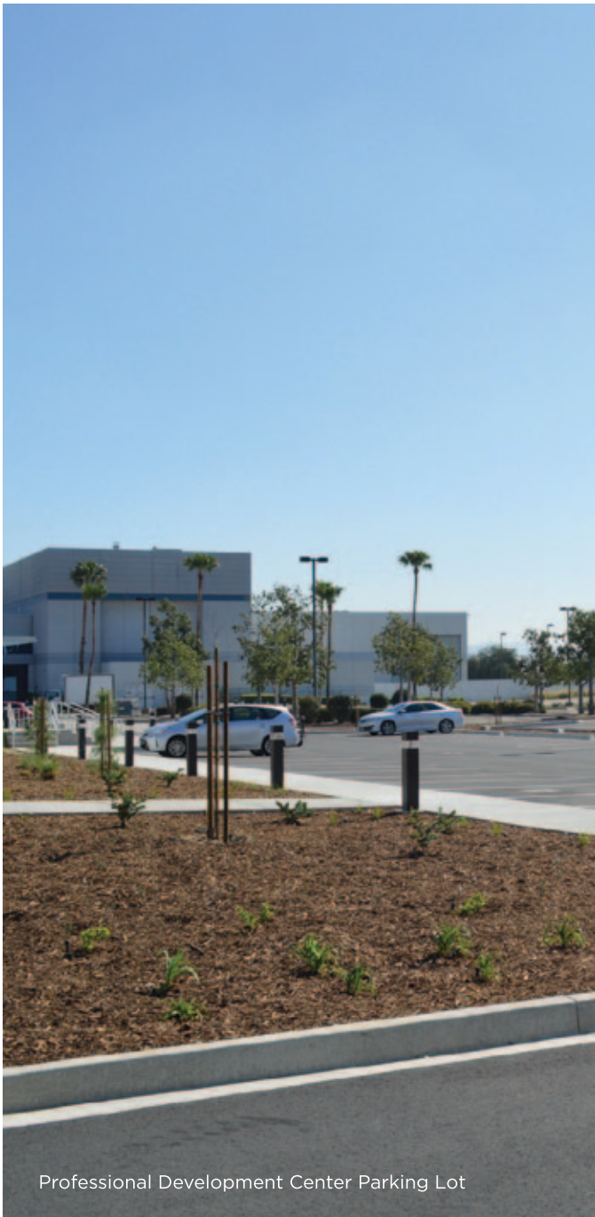
Professional Development Center Parking Lot