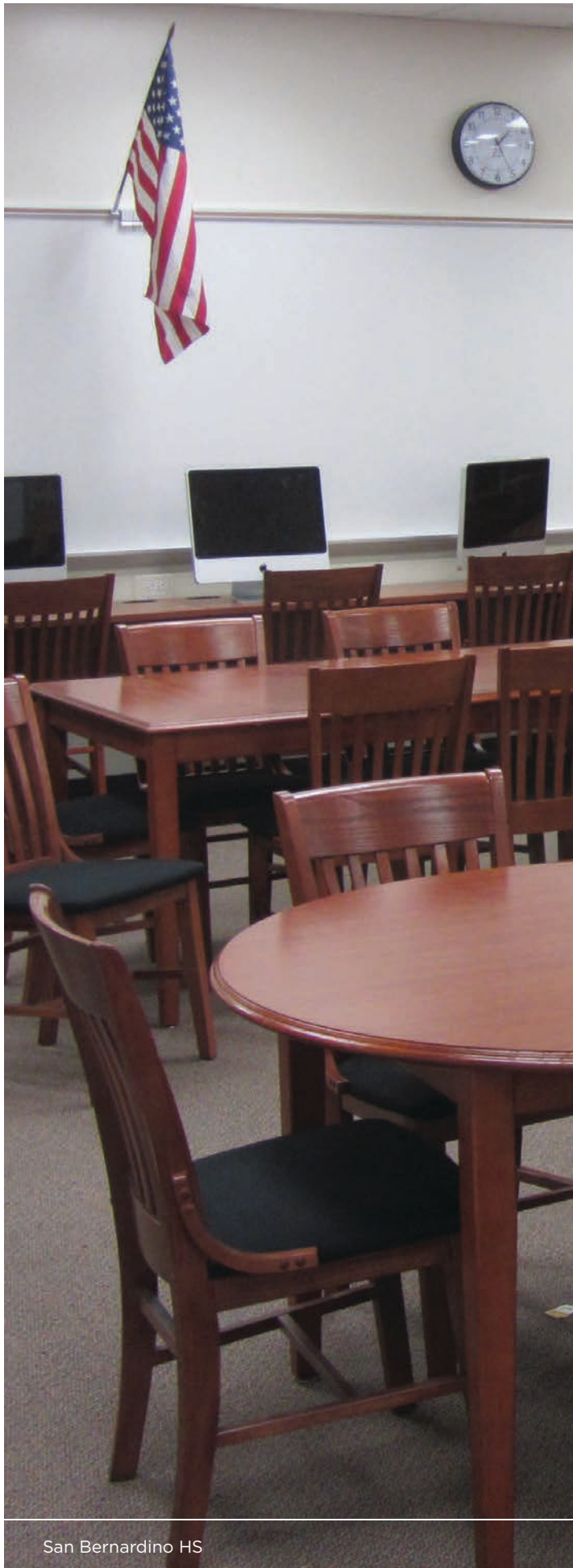
San Bernardino HS