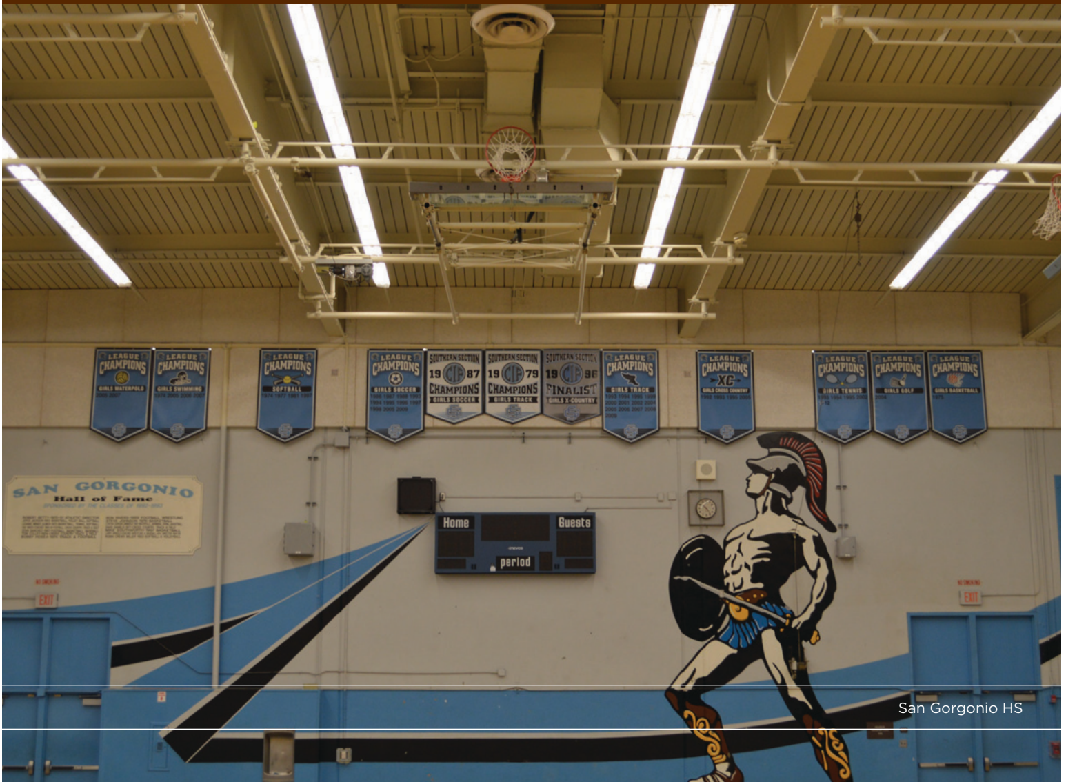
San Geronio HS