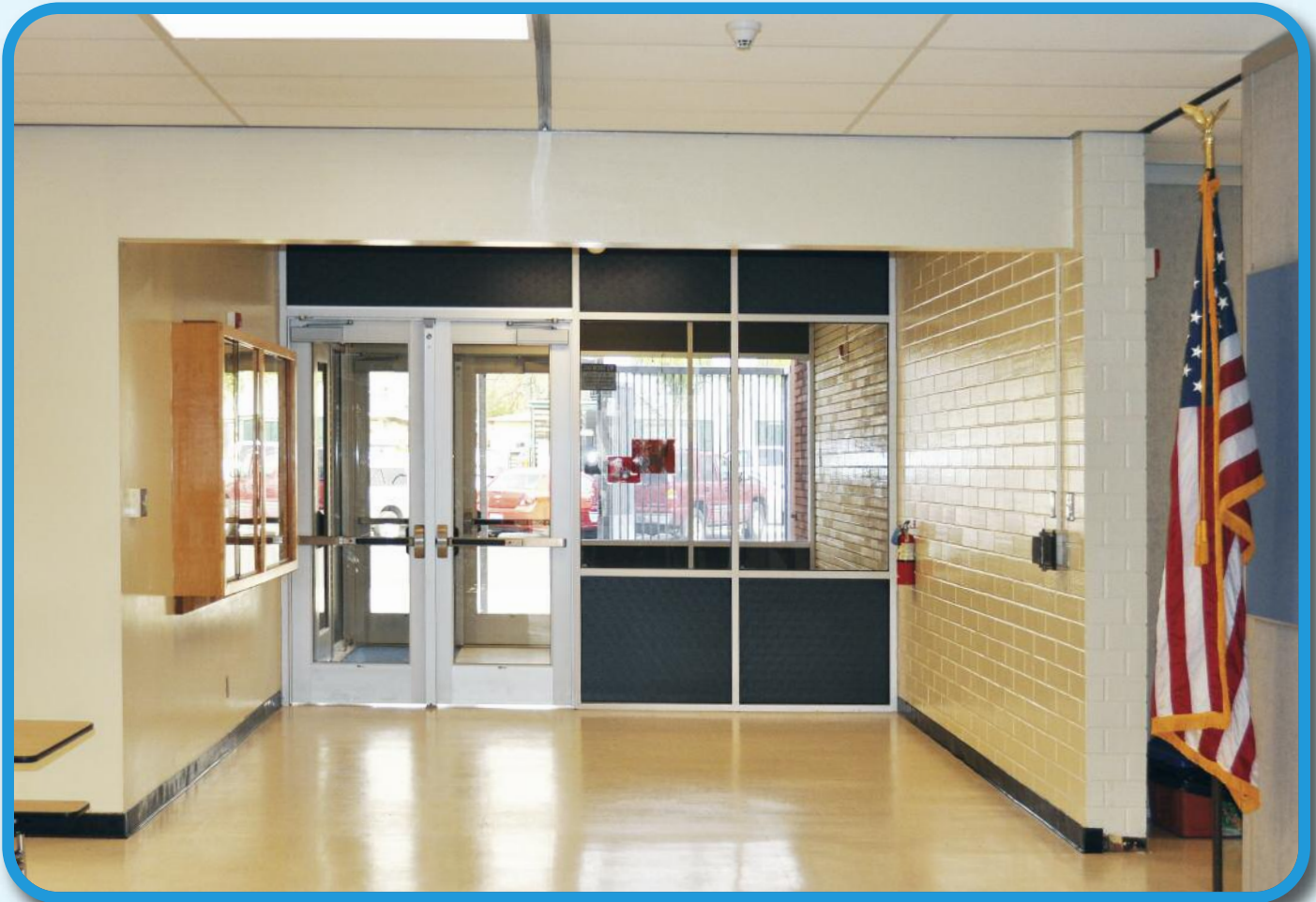
Lincoln ES- Modernization Project