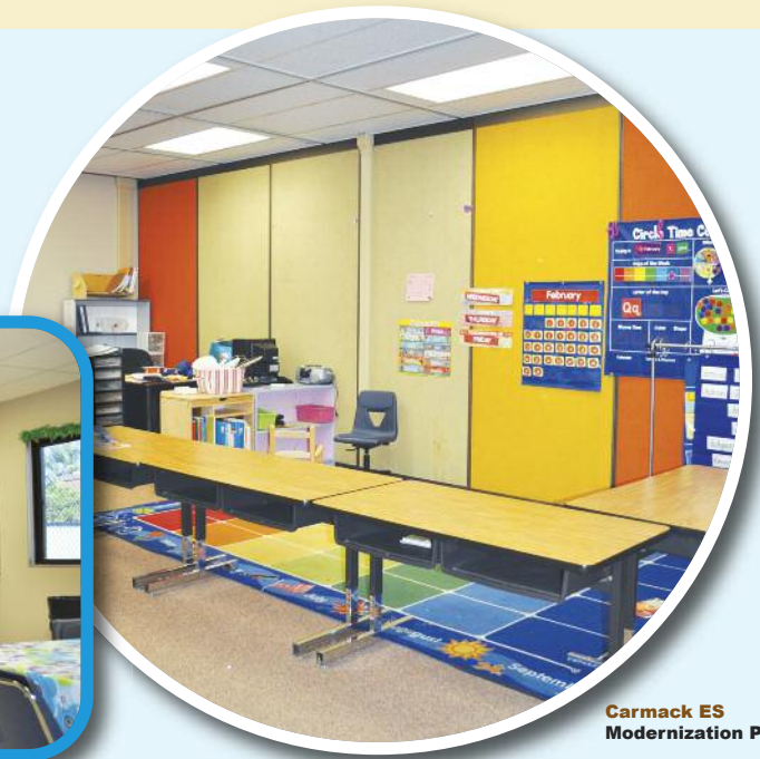
Carmack ES Modernization Project