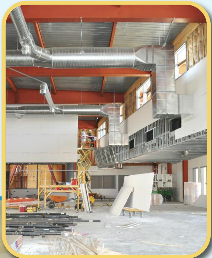
Indian Springs HS- New Campus Project