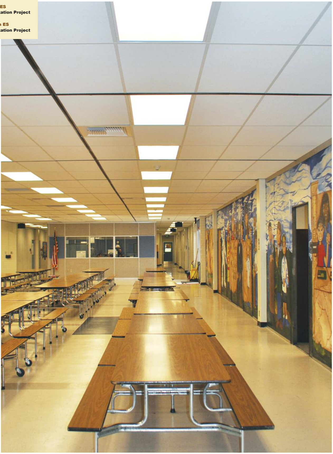
Lincoln ES Modernization Project

Right: Anderson ES Modernization Project