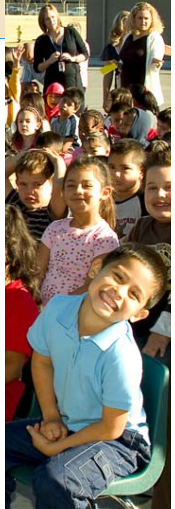
Jones Elementary School Dedication Ceremony, December 7, 2006.