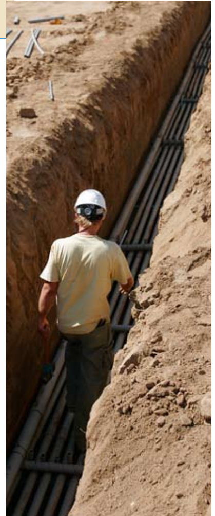
New campus project Rodriguez Elementary School underground work.

For more information visit the COC web page at the following address: http://www.sbcusdfacilities.com .