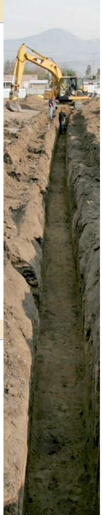
New campus Wong Elementary School trenchwork.