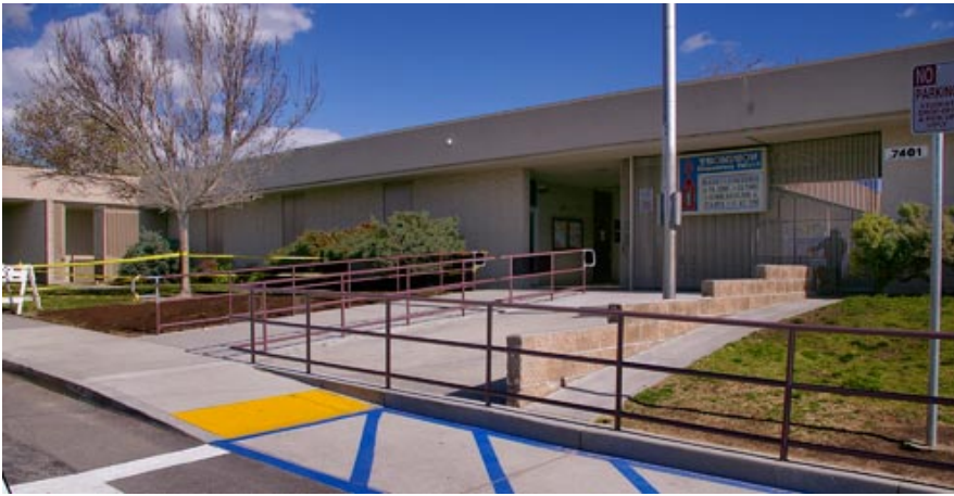
General fire access – lane markings, knox box, fire alarms, extinguishers, smoke/heat detectors. Emergency exit signage;