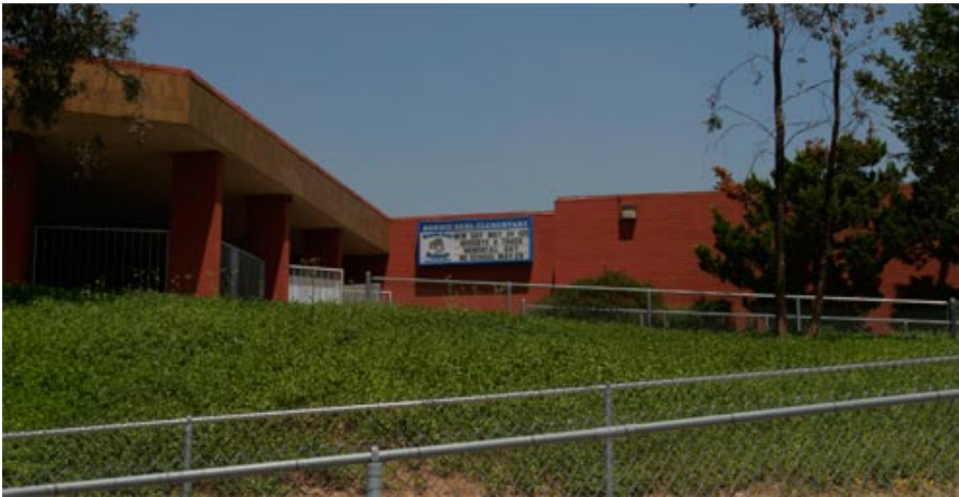
General Site: accessible gates, directional signs, re-stripping partial parking lot, accessible ramp.