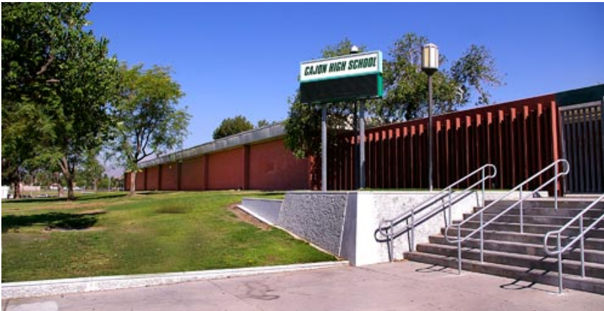
General Site: handicapped parking signs, door signs, gates, wheelchair lift, asbestos, lead paint abatement, thresholds, handrails and footings, chain link gates.