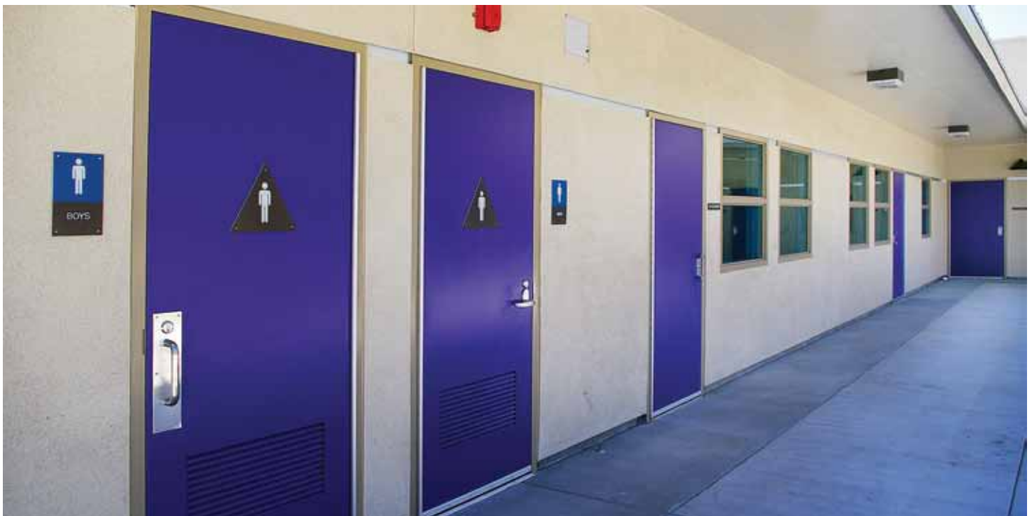
Pacific High School: SDC Addition