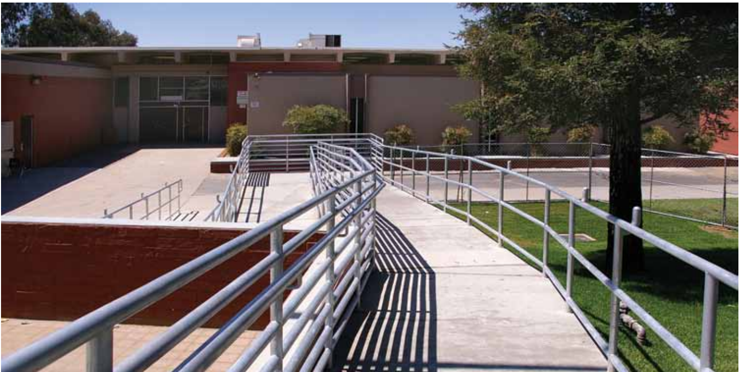
Serrano Middle School: Modernization