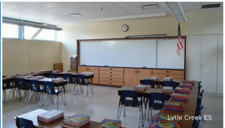
Lytle Creek ES