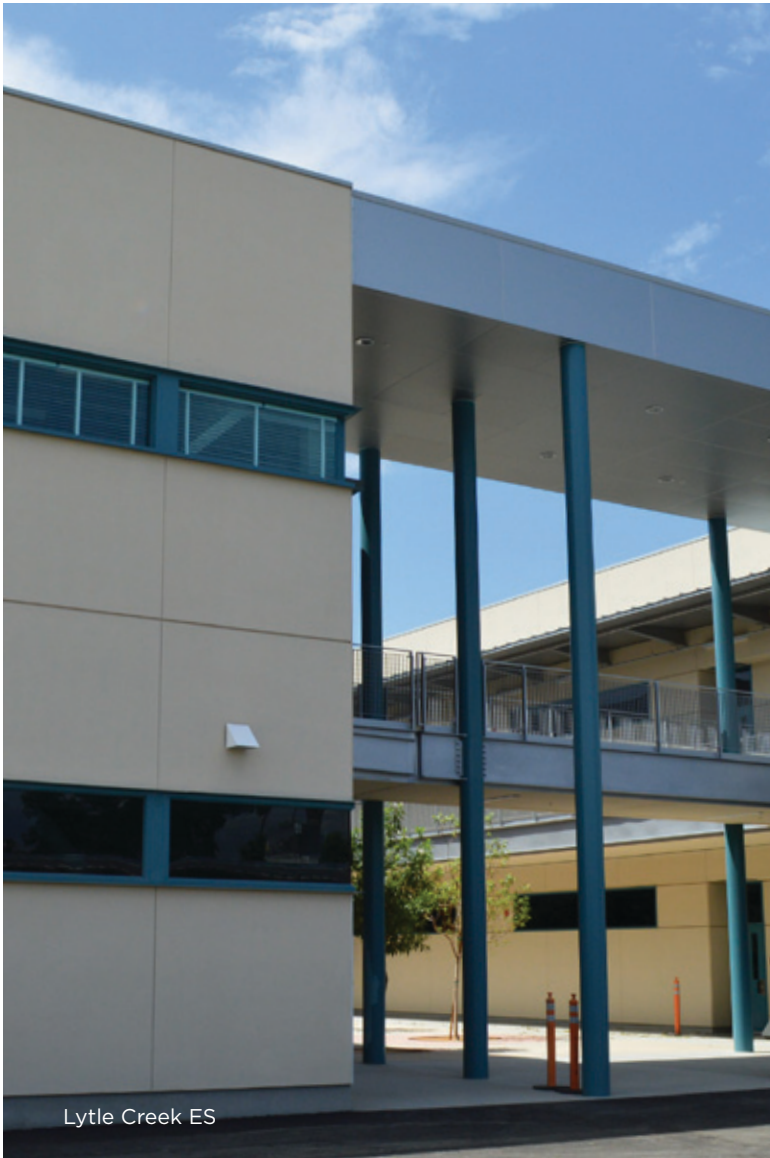
Lytle Creek ES