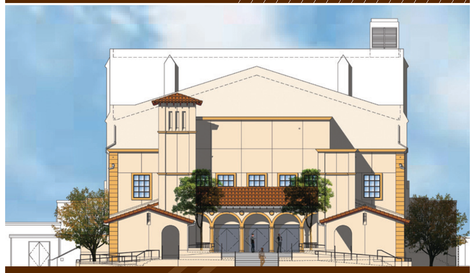
San Bernardino HS - Auditorium Rendering