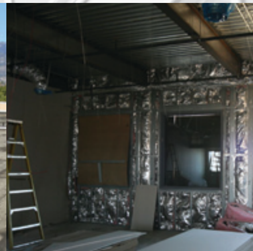
Heating, Ventilation and Air Conditioning