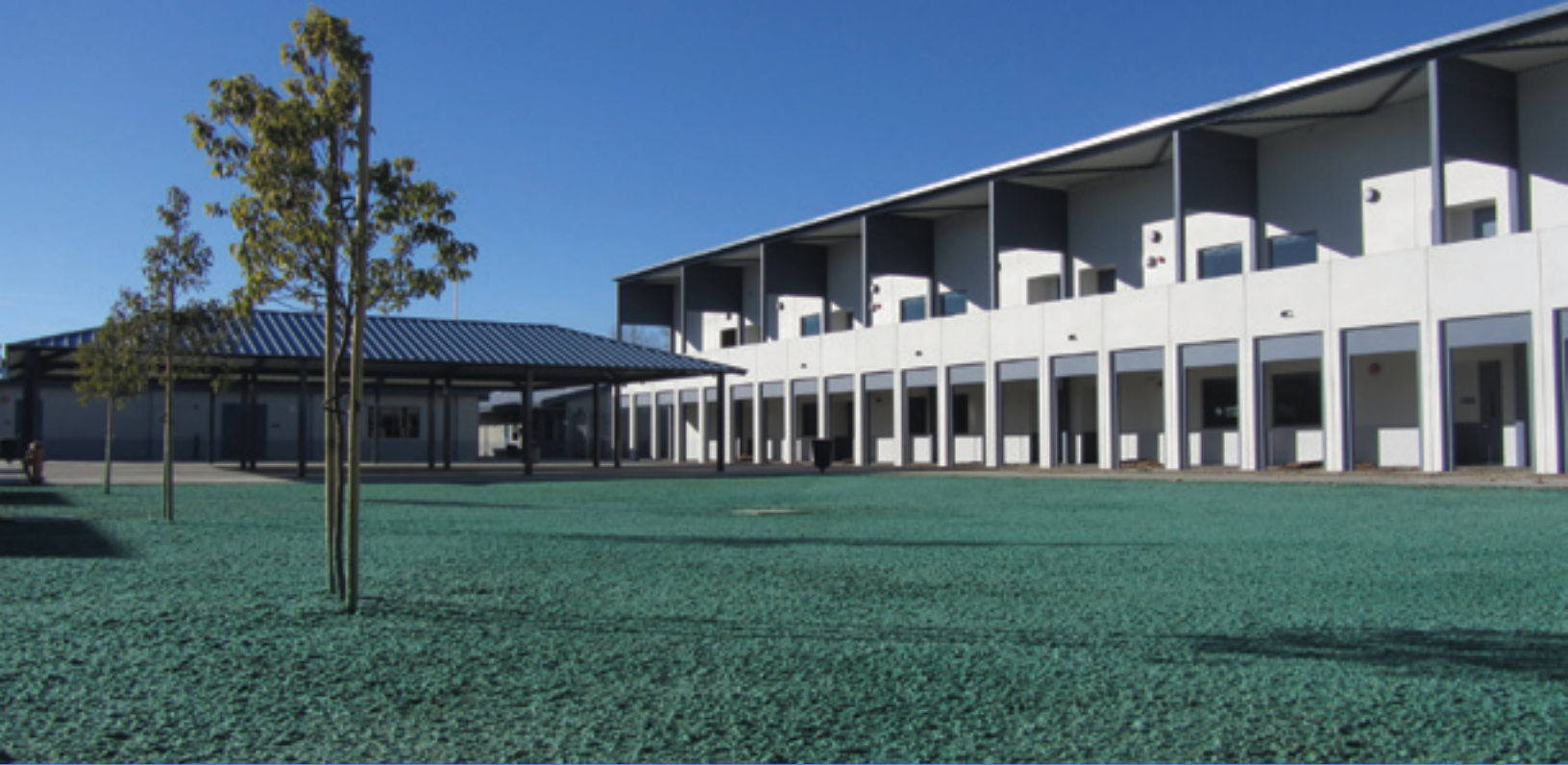
Little Mountain ES