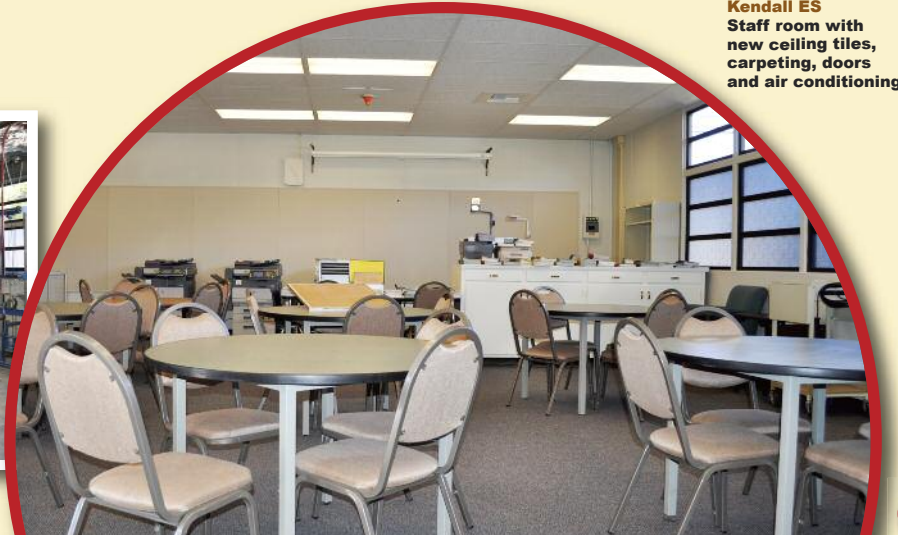
Kendall ES Staff room with new ceiling tiles, carpeting, doors and air conditioning