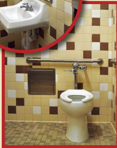
Hunt ES- New restroom complete with lights, tiles, flooring and fixtures at Administration Building