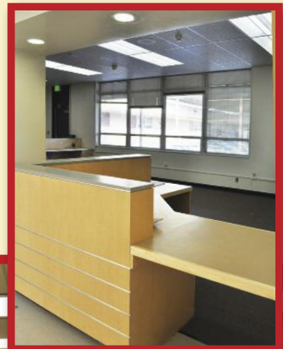
Lankershim ES Remodeled Administration Area with new finishes, lighting, cabinets and public address system