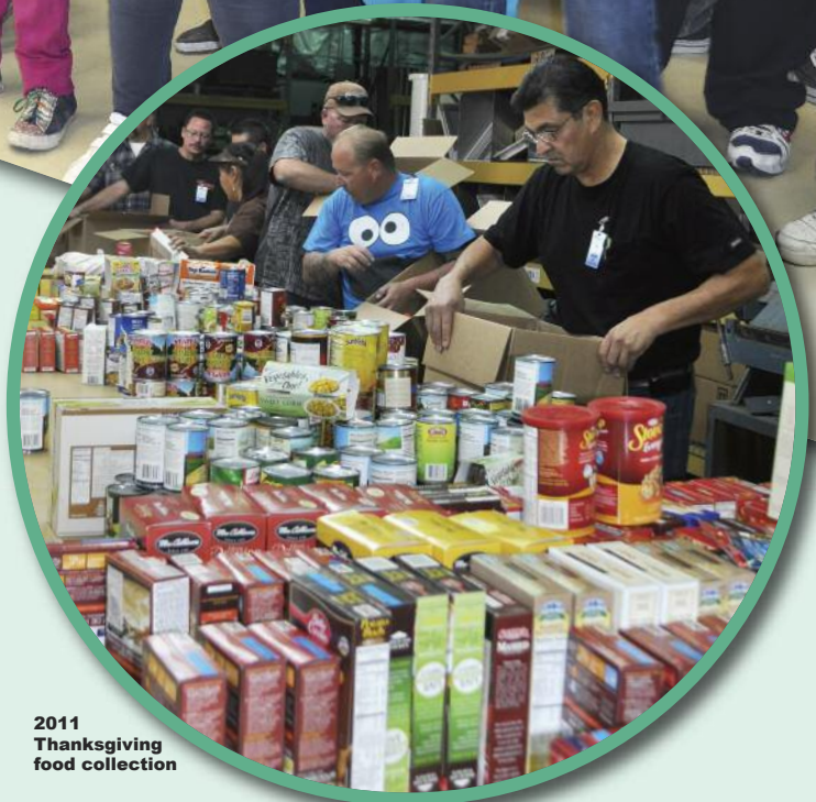
2011 Thanksgiving food collection

Each year the Advisory Committee hosts an annual employee appreciation picnic lunch, Thanksgiving food drive and toy collection for students at Anderson School. During the month of November the Committee collects food item donations to provide meals for families in need. In November 2011, 29 meal boxes were assembled and combined with grocery store gift cards provided by Advisory Committee fundraisers.