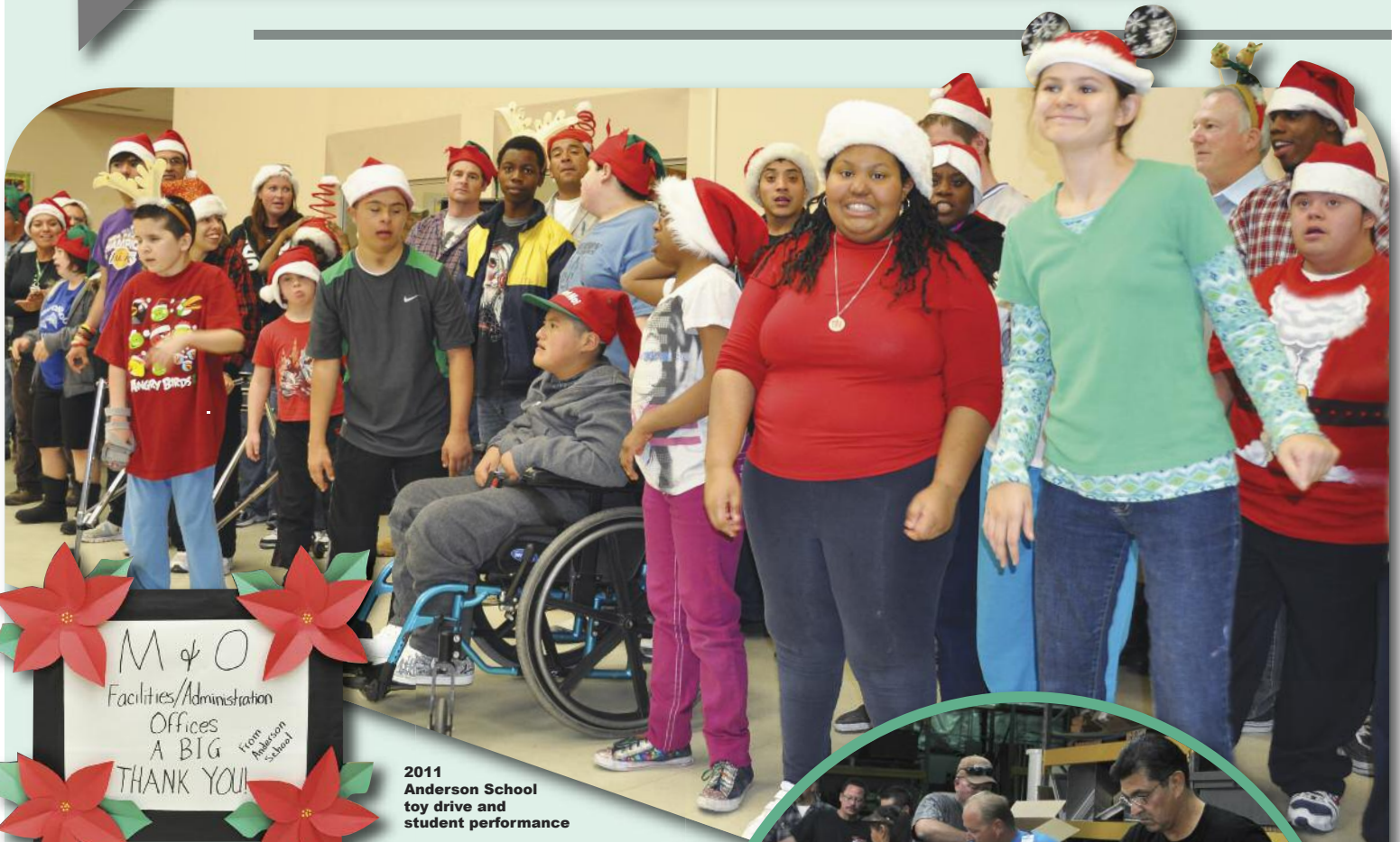
2011 Anderson School toy drive and student performance

In addition to all the good work the District's Maintenance & Operations Department does, they are also involved in functions performed through the Advisory Committee. The Advisory Committee consists of one representative from each shop in the Maintenance & Operations Department plus staff members from Facilities Management. Twice a month the Committee meets to discuss, share and resolve a variety of issues such as safety and community awareness. The Committee's main focus is to support employees, students and community members throughout the year.