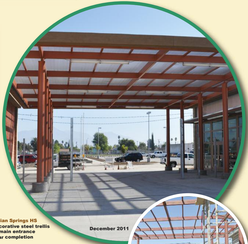
Indian Springs HS Decorative steel trellis at main entrance near completion