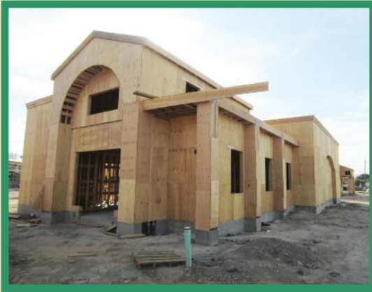
Captain Leland F. Norton ES Administration Building under construction