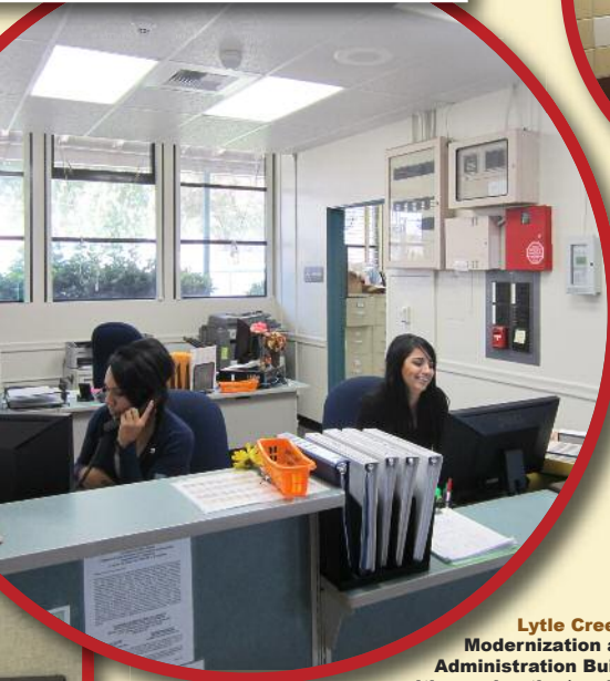
Lytle Creek ES Modernization at the Administration Building with new heating/cooling unit, ductwork, ceiling, lights, paint, carpeting/floor tiles