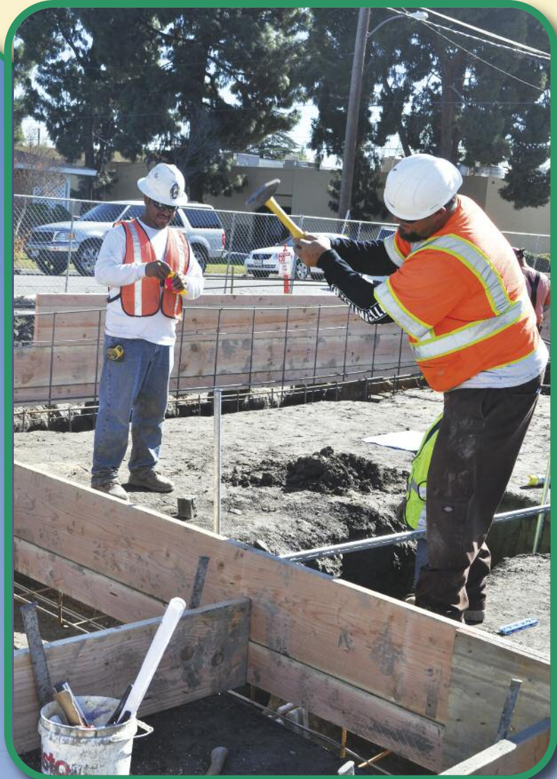
Middle College ES Building forms for footings