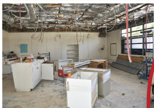
Kendall ES- Staff room under construction November 2011