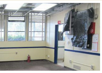
Lytle Creek ES- Administration Building under construction, October 2011