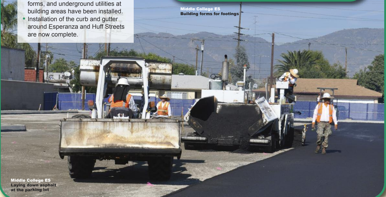
Middle College ES Laying down asphalt at the parking lot