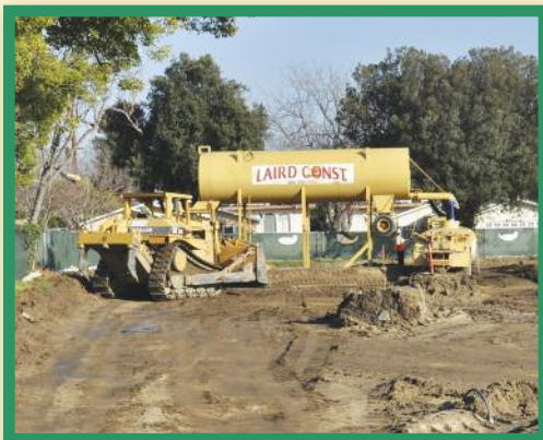
George Brown ES- Mass grading of the site