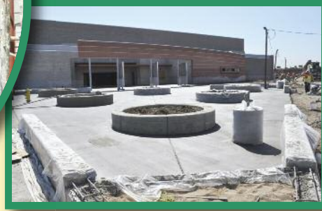
Indian Springs HS Circular Seat Walls Outside Gymnasium