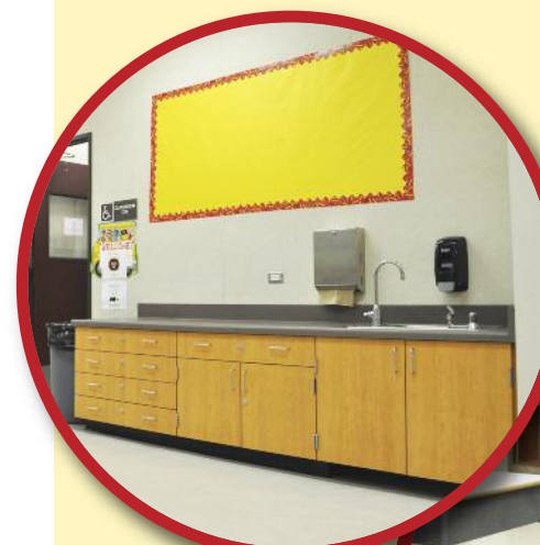
Mt. Vernon ES New Casework and Sinks