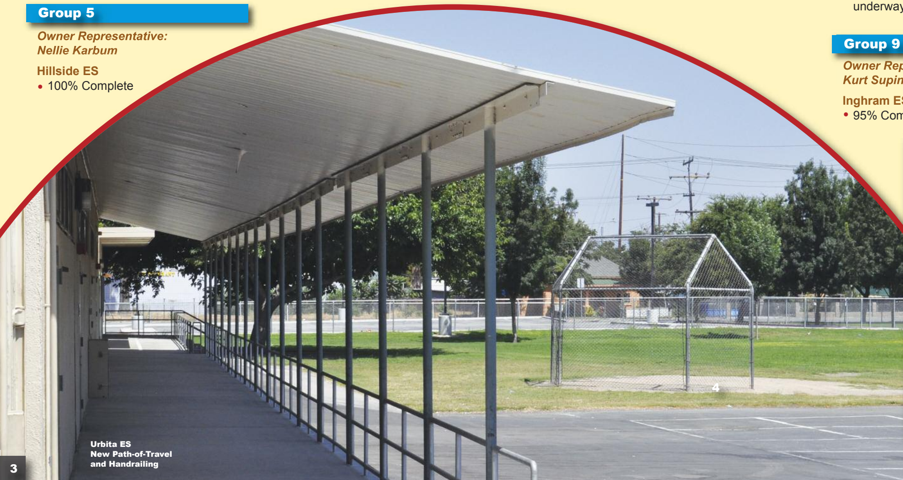
Urbita ES New Path-of-Travel and Handrailing