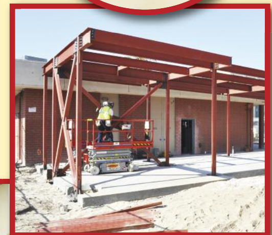
San Bernardino HS Steel Framing at Administration Addition