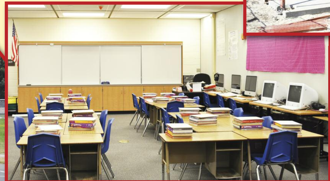
Ramona-Alessandro ES-Classroom Teaching Walls and Maintenance Work completed