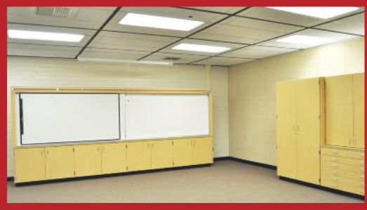
Emmertton ES New Ceiling, Lighting and Teaching Walls