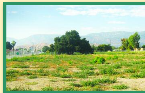
Future Site for Dr. Mildred D. Henry ES

The large oak tree at the new Dr. Mildred D. Henry ES was saved. The campus design incorporates the tree into the drive aisle approach to the campus.