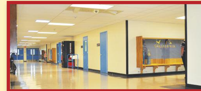
San Geronio HS Modernized Lighting, Ceiling and Walls