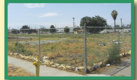
Future Site for Middle College ES