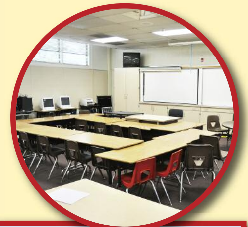
Cypress ES Typical Modernized Classroom