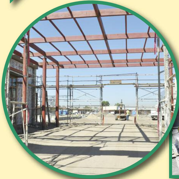
Indian Springs HS Decorative Steel Trellis at Main Entrance.