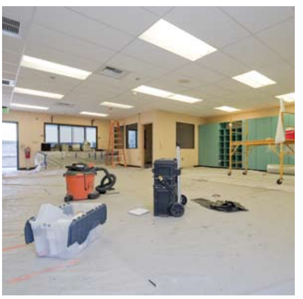
Inside one of the portable classrooms that is currently undergoing renovations at Hunt ES.