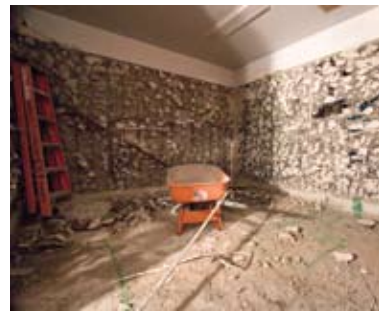
Abatement is also underway inside the restrooms.