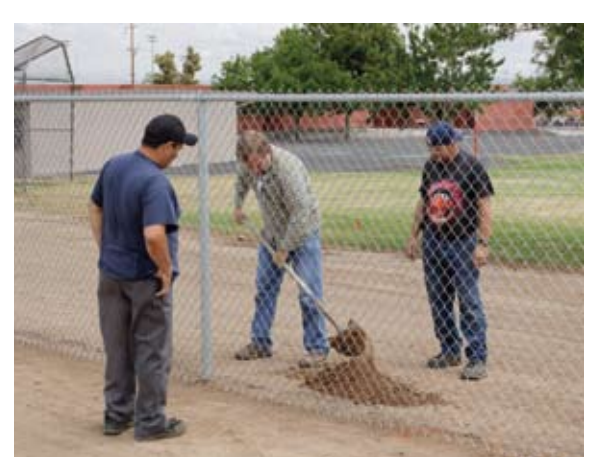
Grounds workers digging the last of the holes to expand the current irrigation system for new grass.