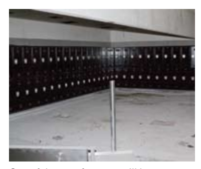
One of the new features will be a new girls' team locker room.