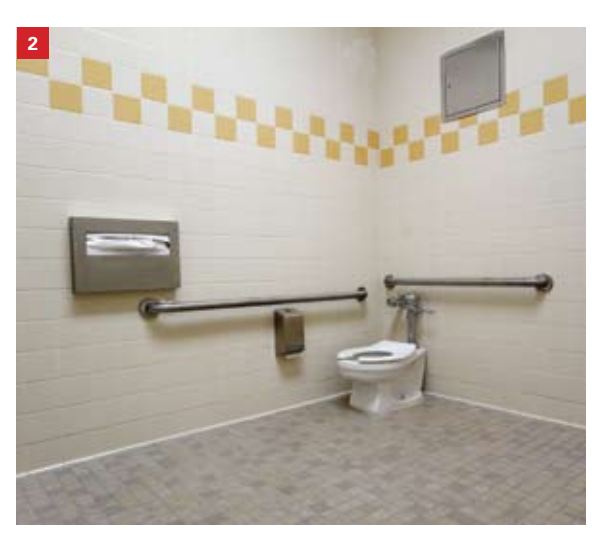
1 Work is almost completed inside this restroom at Anderson Special Education, along with two adjoining classrooms. 2 One of several newly refurbished restrooms at Del Rosa ES. 3 A new ramp and handrails were built in front of this classroom at Monterey ES.