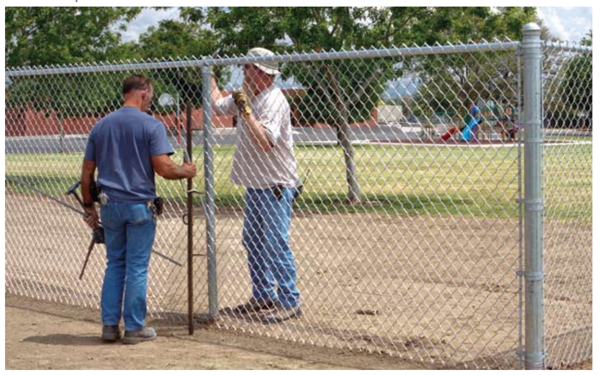
Maintenance Crew workers double-checking the new fence to ensure proper installation and that no sharp edges are found along the edges of the chain link.