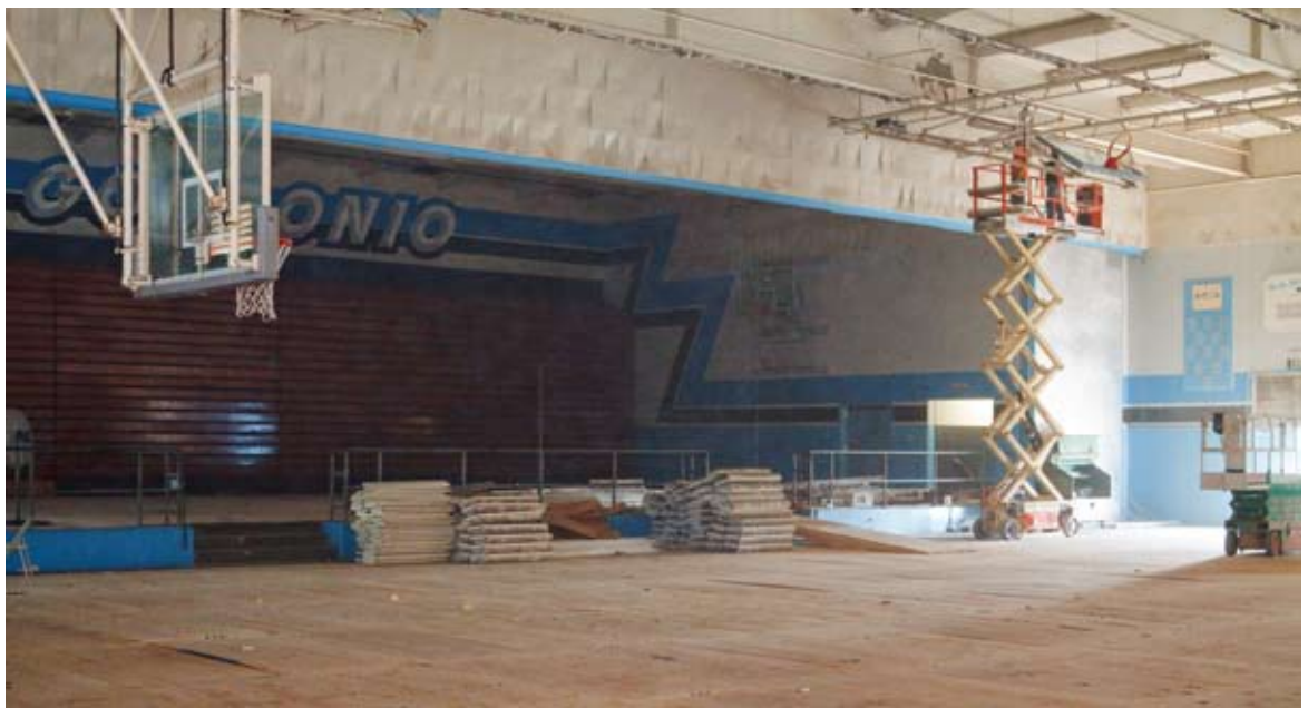
Protective boards line the top of the gymnasium floor. Currently, abatement work has started, including the removal of the current lighting system, as seen here.