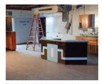
The inside of this home economics classroom is currently being abated.