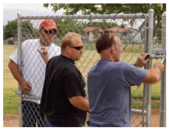
Installation of a new gate. The old fence previously had sharp edges along the top edge which could be dangerous to the children.