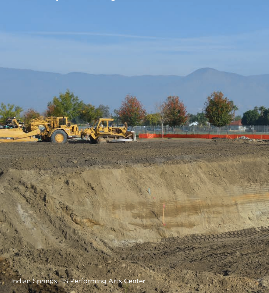
Indian Springs HS Performing Arts Center