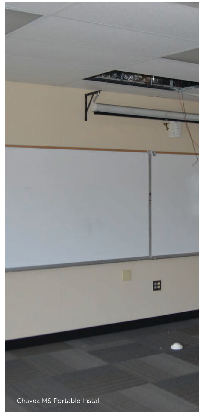
Chavez MS Portable Install

In accordance with Proposition 39, a performance audit and financial audit was performed by the independent auditor firm of Varrinek, Trine, Day & Co., LLP. The performance audit confirmed that the San Bernardino City Unified School District has properly accounted for the expenditures of the funds held in the Bond Building Fund and that such expenditures were made on authorized bond projects. Further it was noted that the funds held in the Bond Building Fund and expended by the district were not expended for salaries of school administrators or other operating expenditures. The financial audit confirmed that the financial statements for fiscal year ending June 30, 2016, presented fairly in all material respects, the financial position and results of operations for the San Bernardino City Unified School District as of June 30, 2016, in conformity with accounting principles generally accepted in the United States of America. There were no findings nor questioned costs related to the financial audit of the Measure T & N Building Funds for the year ended June 30, 2016.