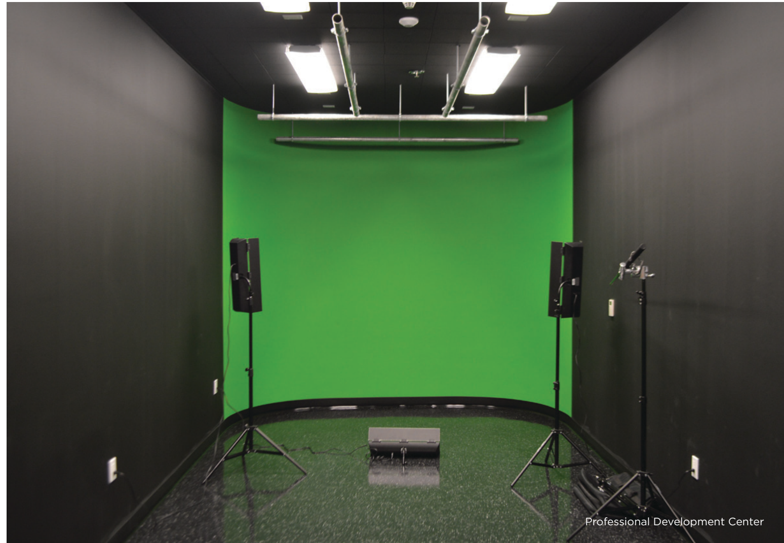
Professional Development Center

On the Cover Professional Development Center