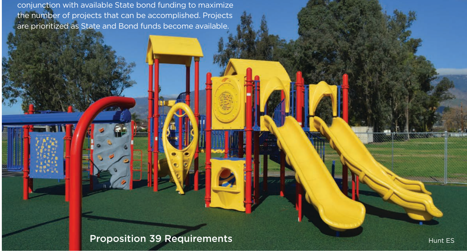
Proposition 39 Requirements

On November 6, 2012, voters passed Bond Measure N - the San Bernardino City Unified School District Student Safety and School Repair Measure. Measure N provides bonds in the amount of $250 million and passed overwhelmingly with 71.4% of the vote. To date, Measure N has provided new school police vehicles, printing services technology and equipment, improved lighting for Creative Before-and After Programs for Success (CAPS), construction projects, security and surveillance systems, the purchase of the Professional Development Center and the installation of new digital marquees and playgrounds.