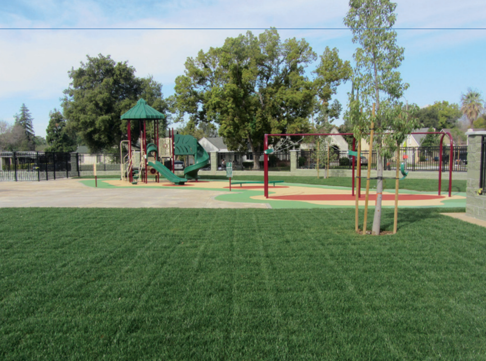
Brown Elementary School