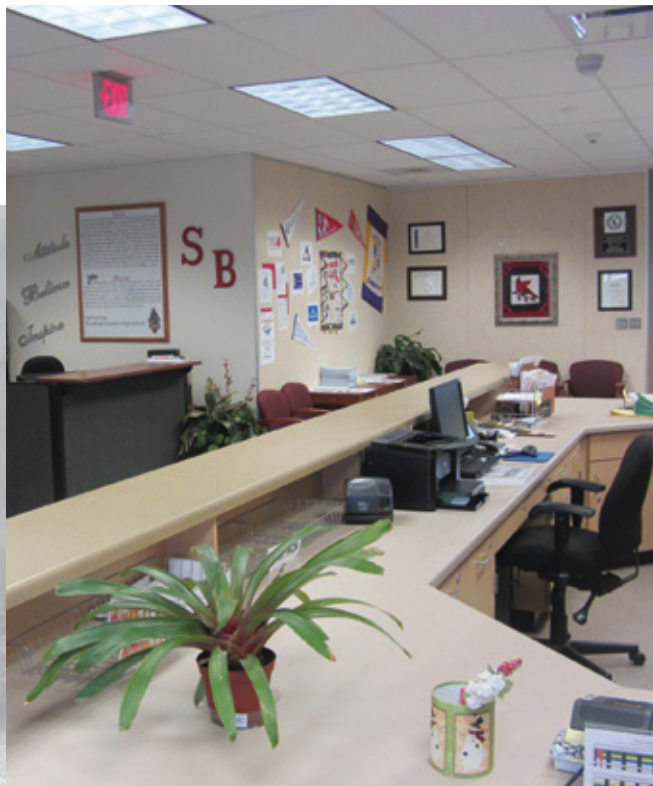
San Bernardino High School