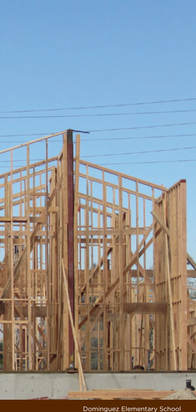
Dominguez Elementary School