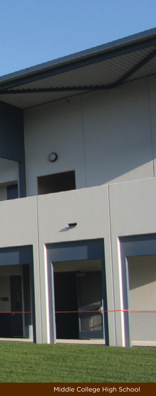
Middle College High School