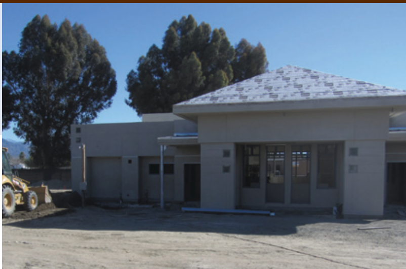
Henry Elementary School

Mt. Vernon Elementary School Brown Elementary School Rio Vista Elementary School