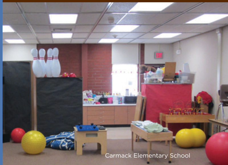
Carmack Elementary School