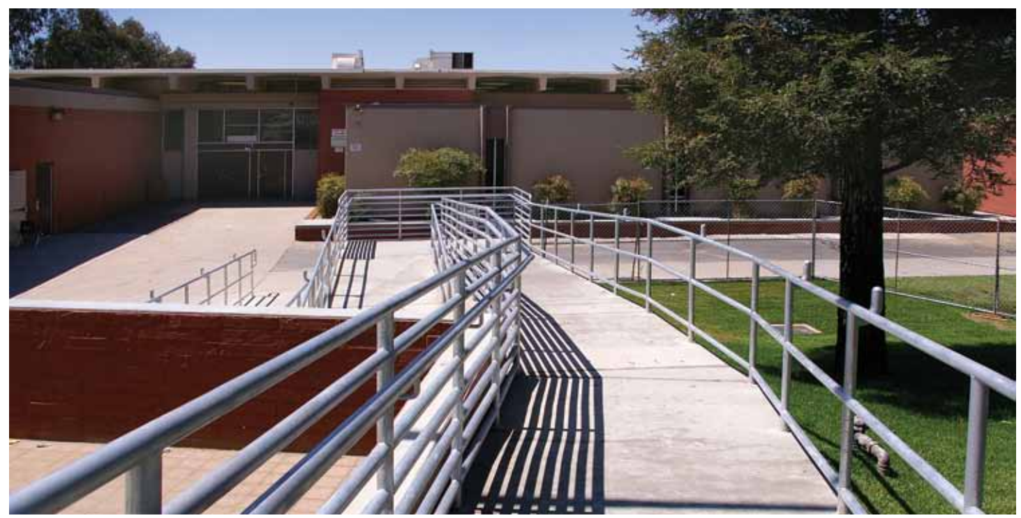
Serrano Middle School: Modernization