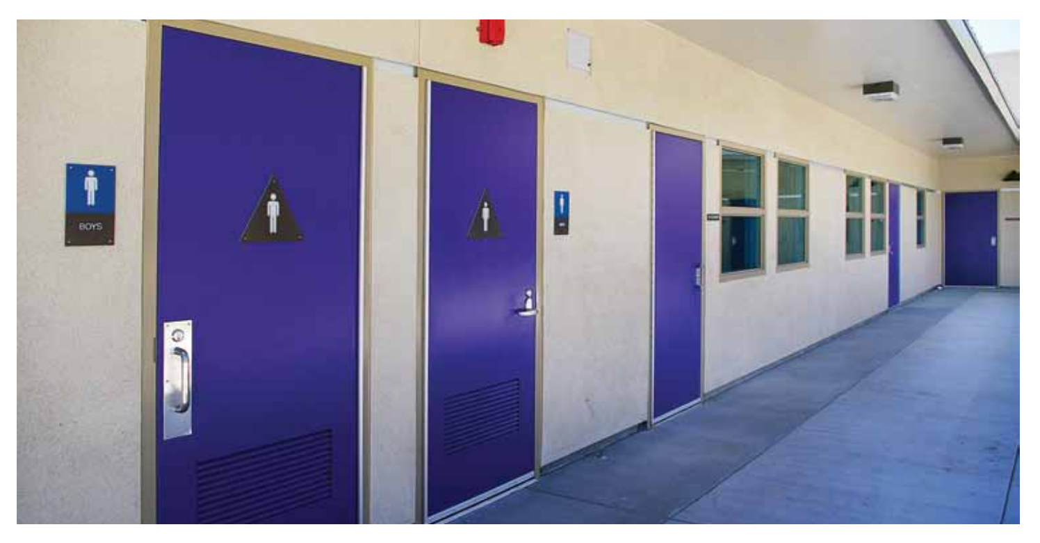
SBCUSD Facilities / Maintenance & Operations